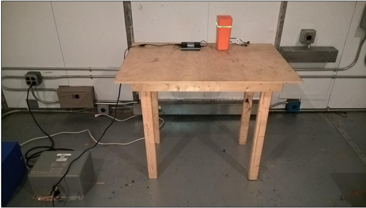
Photograph 3. Conducted Emissions, Test Setup