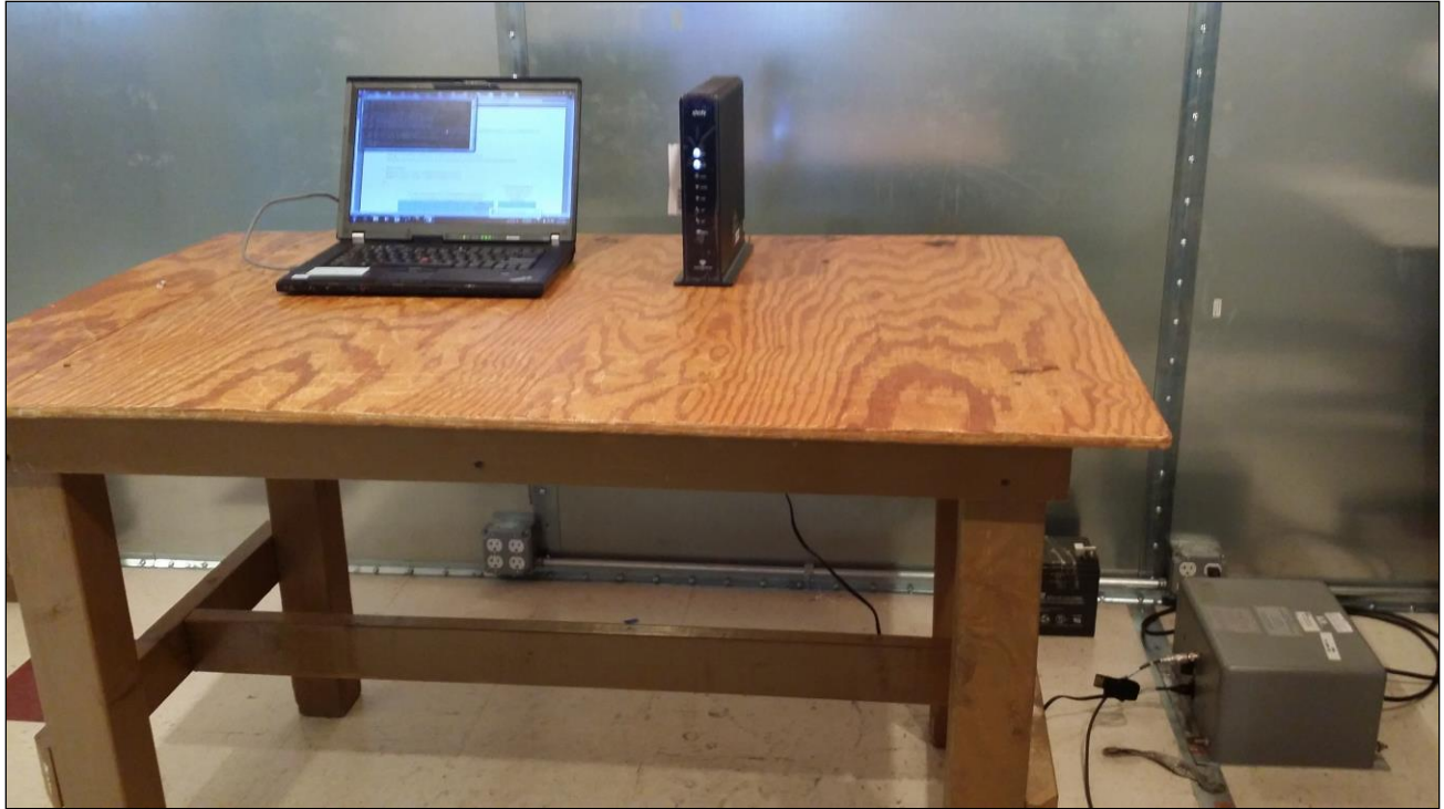
Photograph 1. Conducted Emissions, 15.207(a), Test Setup