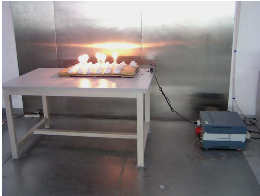
Conduction Emissions – Rear View