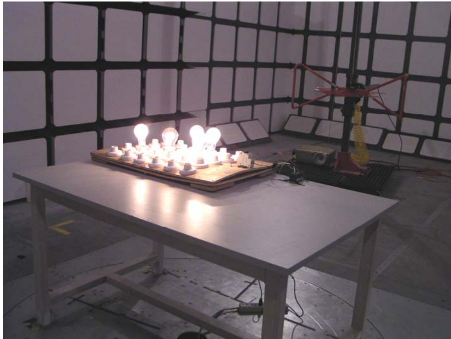
Radiated Emissions - Rear View (30 MHz-1 GHz)