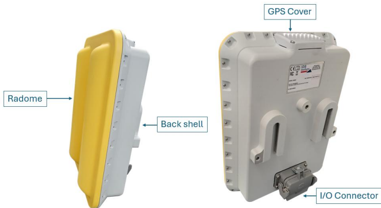
Fig. 1 – IBIS 3D sensor

The sensor consists of an aluminum backshell (the gray part in the following image) and a plastic radome (yellow cover in the following image). A GPS antenna protected by a plastic radome is also mounted on the top of the box (grey cover in the following image):