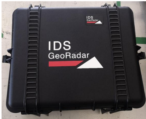
Fig. 3 – IBIS 3D case

The sensor is delivered inside a peli case.