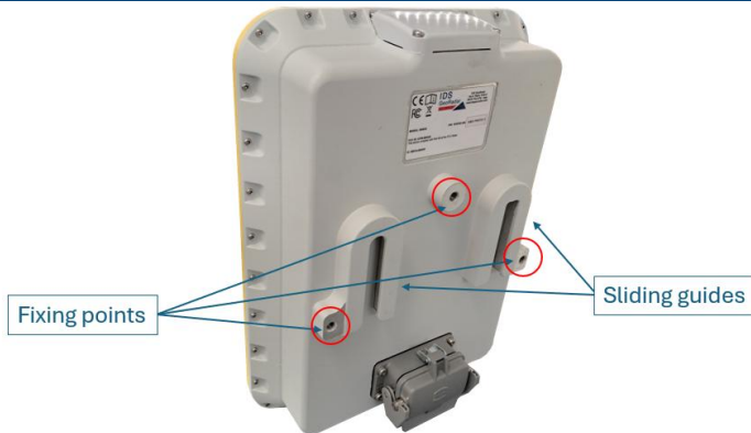
Fig. 2 – IBIS 3D mounting system view

The sensor is delivered ready to run and only the installation on the system is required. The operations to be performed on the sensor for installation on the system will be: