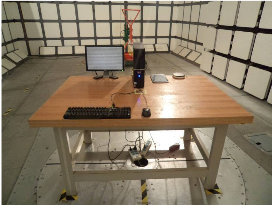
Below 1 GHz: Radiated Emissions – Rear View