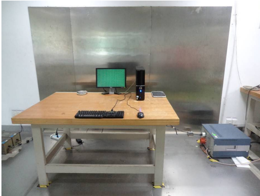
Conducted Emissions – Side View