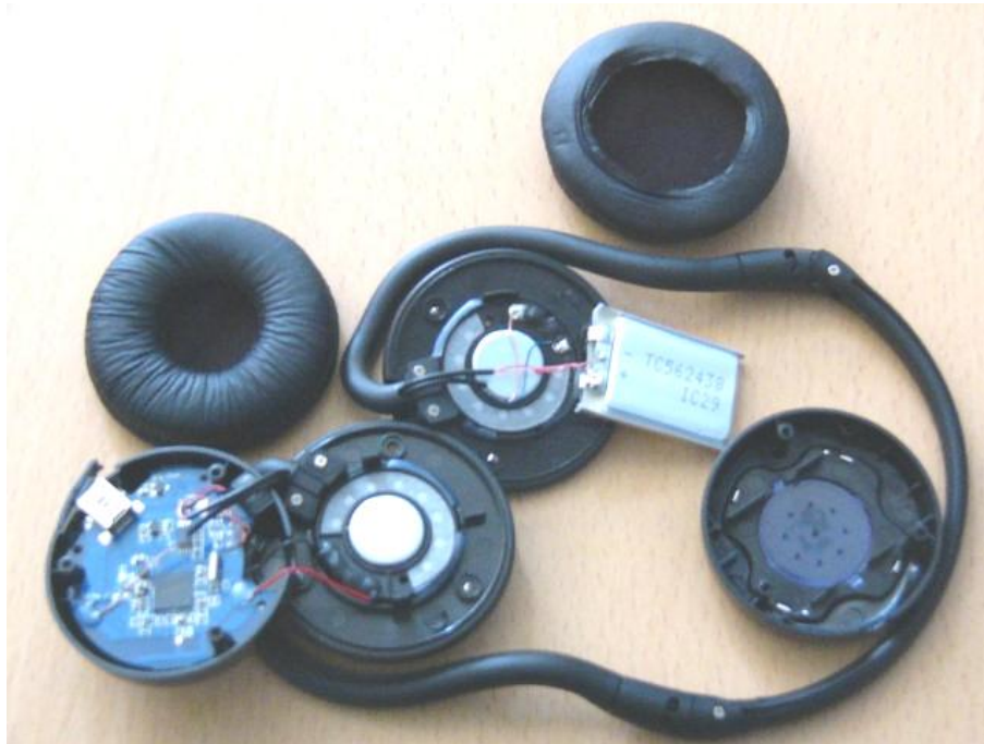
Main board component side