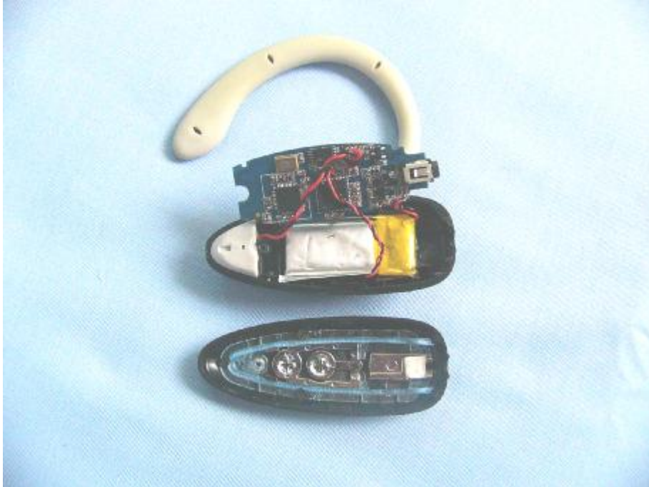
Main & RF board component side