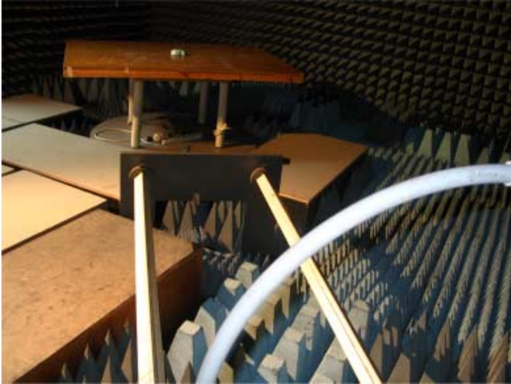
Photograph No.1 Setup for spurious emission measurements in the anechoic chamber below 30 MHz