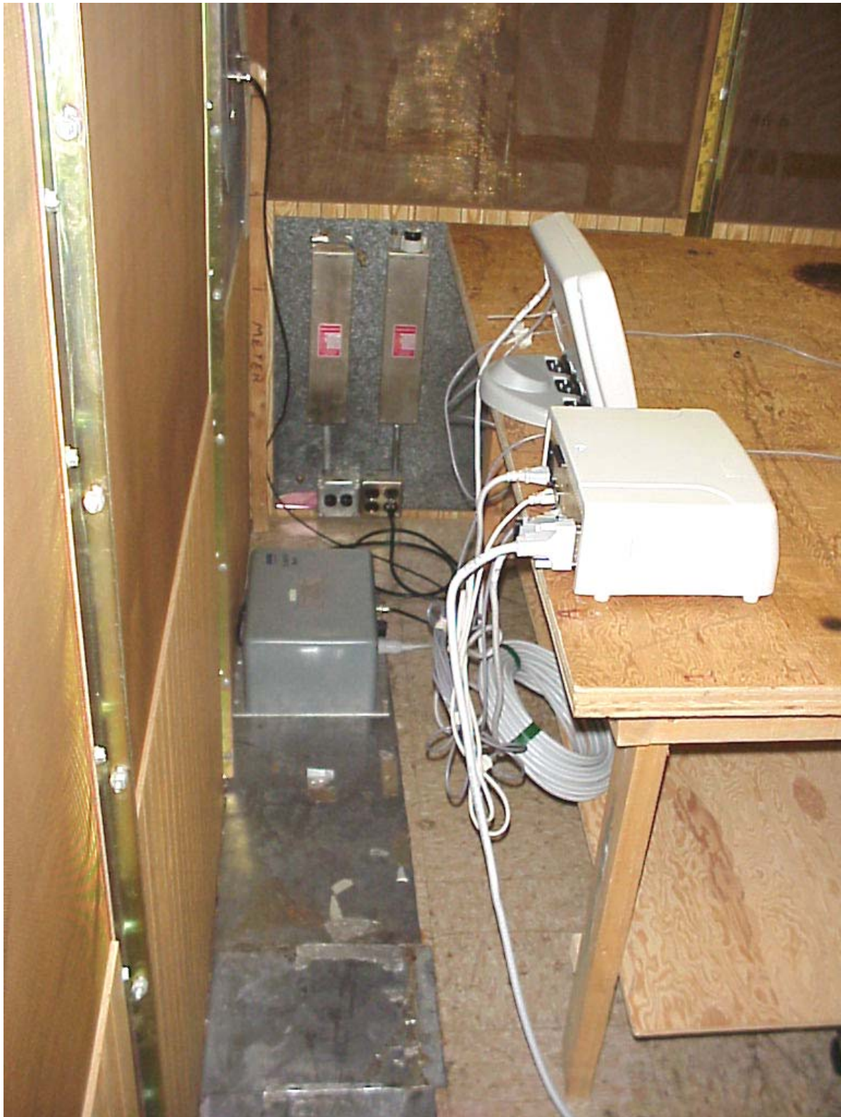
CONDUCTED EMISSIONS TEST SETUP / REAR VIEW

Company: Tyco Healthcare / Mallinckrodt Model Tested: 844003 FCC ID: UEI844003 Canada ID: 3502A-844003