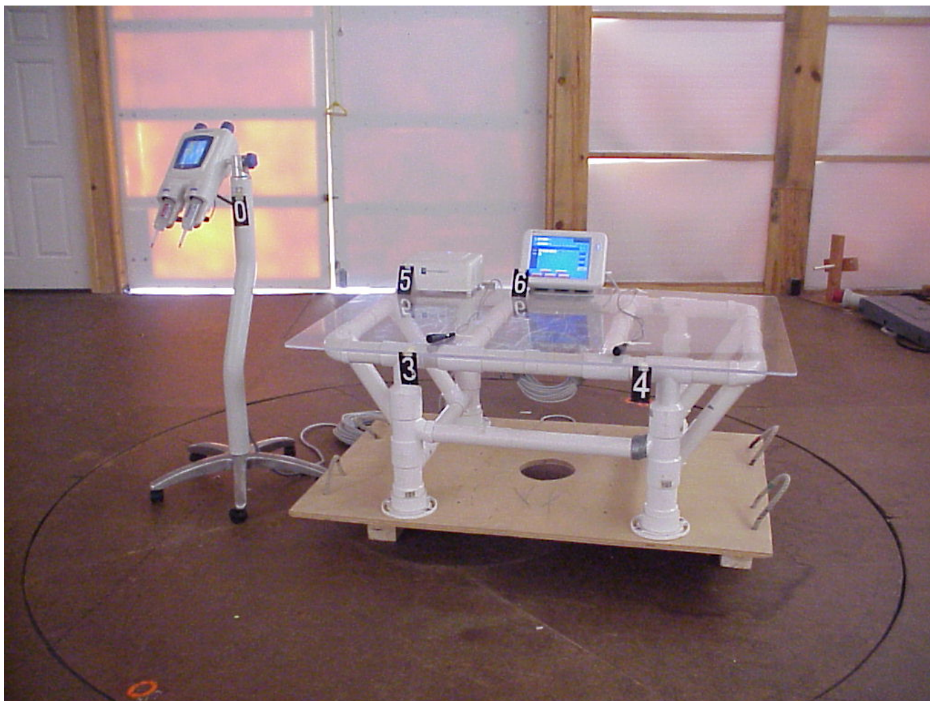
RADIATED EMISSIONS TEST SETUP / FRONT VIEW

Company: Tyco Healthcare / Mallinckrodt Model Tested: 844003 FCC ID: UEI844003 Canada ID: 3502A-844003