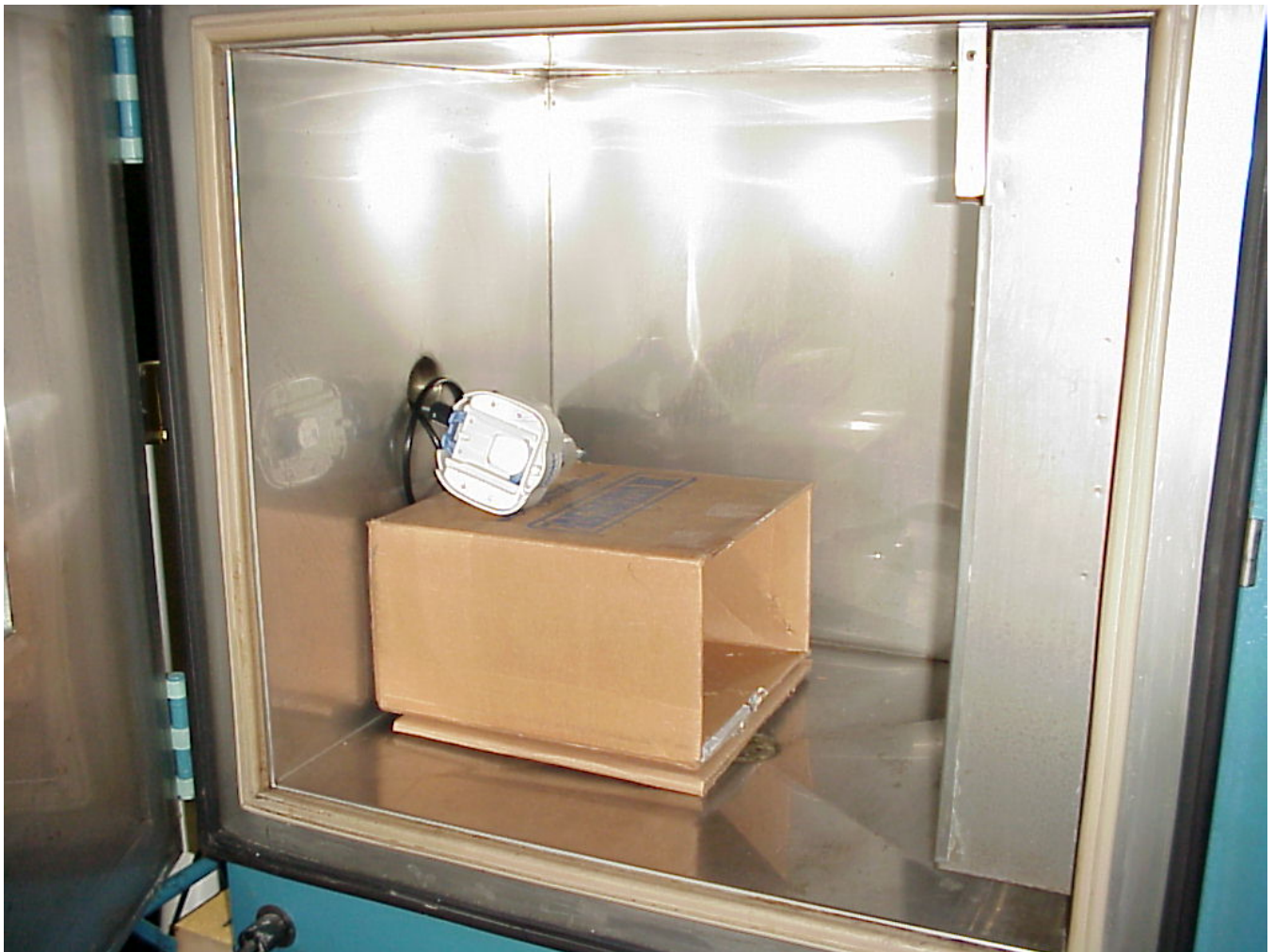
EXTREME CONDITIONS 1

Company: Tyco Healthcare / Mallinckrodt Model Tested: 844003 FCC ID: UEI844003 Canada ID: 3502A-844003