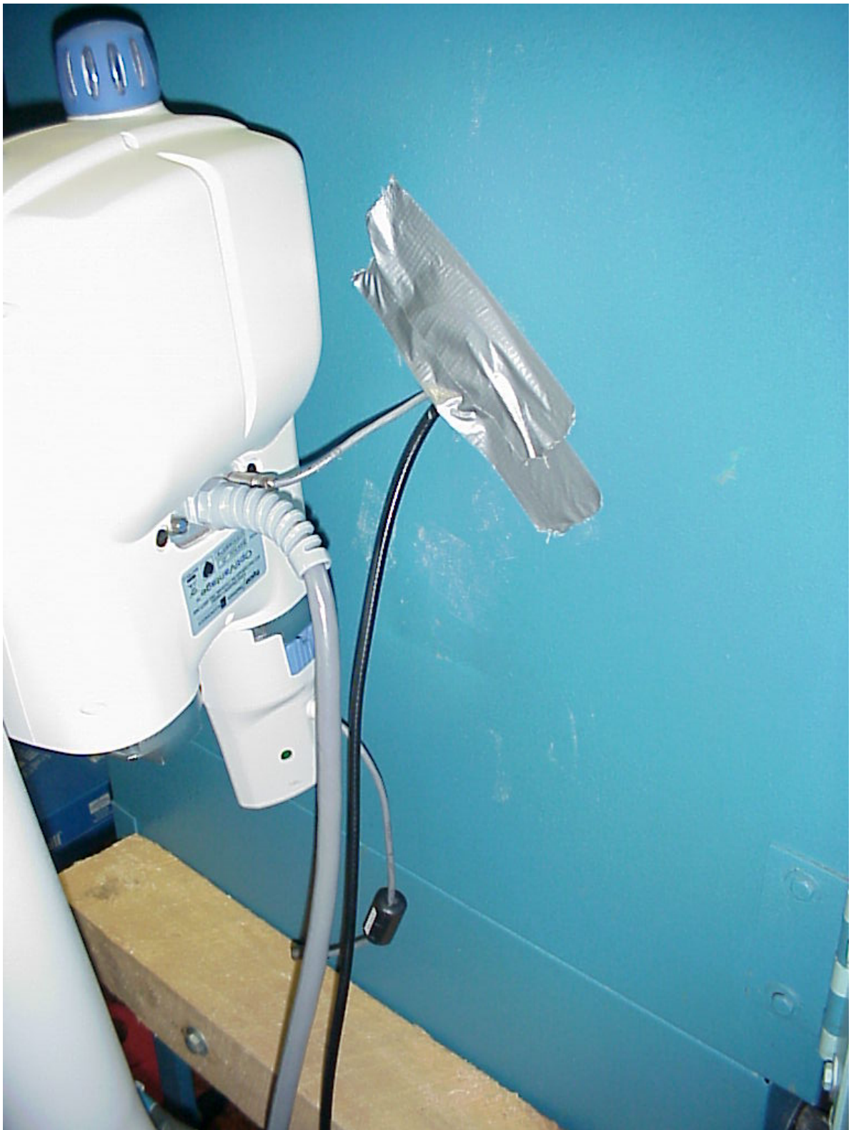
EXTREME CONDITIONS 3

Company: Tyco Healthcare / Mallinckrodt Model Tested: 844003 FCC ID: UEI844003 Canada ID: 3502A-844003