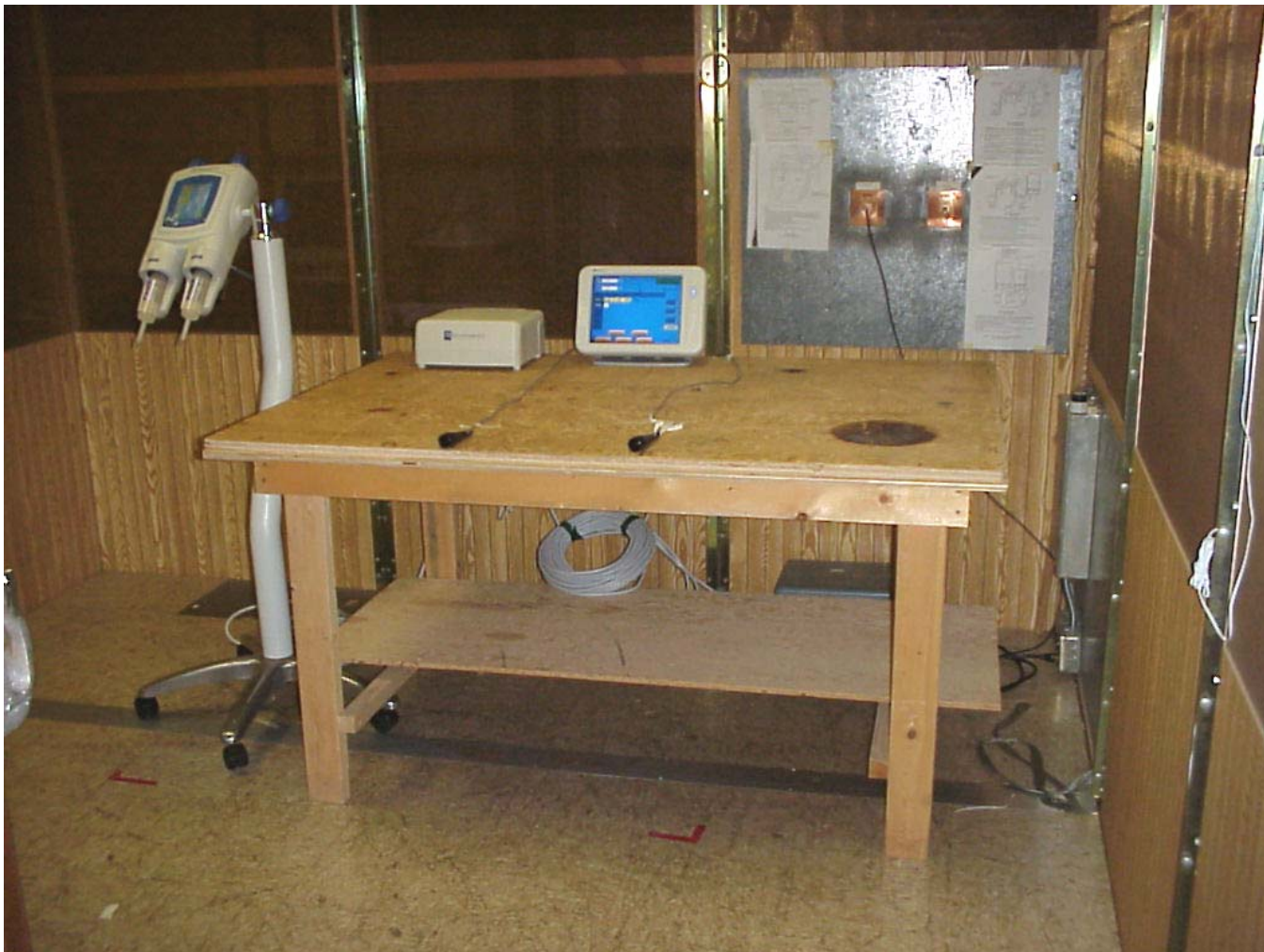
CONDUCTED EMISSIONS TEST SETUP / FRONT VIEW

Company: Tyco Healthcare / Mallinckrodt Model Tested: 844003 FCC ID: UEI844003 Canada ID: 3502A-844003