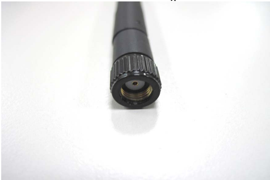
Antenna: riverside SMA type

Unless otherwise stated the results shown in this test report refer only to the sample(s) tested and such sample(s) are retained for 90 days only. This test report cannot be reproduced, except in full, without prior written permission of the Company. 除非另有說明，此報告結果僅對測試之樣品負責，同時此樣品僅保留90天。本報告未經本公司書面許可，不可部份複製。 This document is issued by the Company subject to its General Conditions of Service ( www.sgs.com/terms_and_conditions.htm ) and Terms and Conditions for Electronic Documents ( www.sgs.com/terms_e-document.htm ). Attention is drawn to the limitations of liability, indemnification and jurisdictional issues established therein. Even if printed this electronic document is to be treated as an original within the meaning of UCP 600 article 20b. The authenticity of this document may be verified at www.sgsonsite.com/authentication . Any holder of this document is advised that information contained hereon reflects the Company's findings at the time of its intervention only and within the limits of client's instructions, if any. The Company's sole responsibility is to its Client and this document does not exonerate parties to a transaction from exercising all their rights and obligations under the transaction documents.