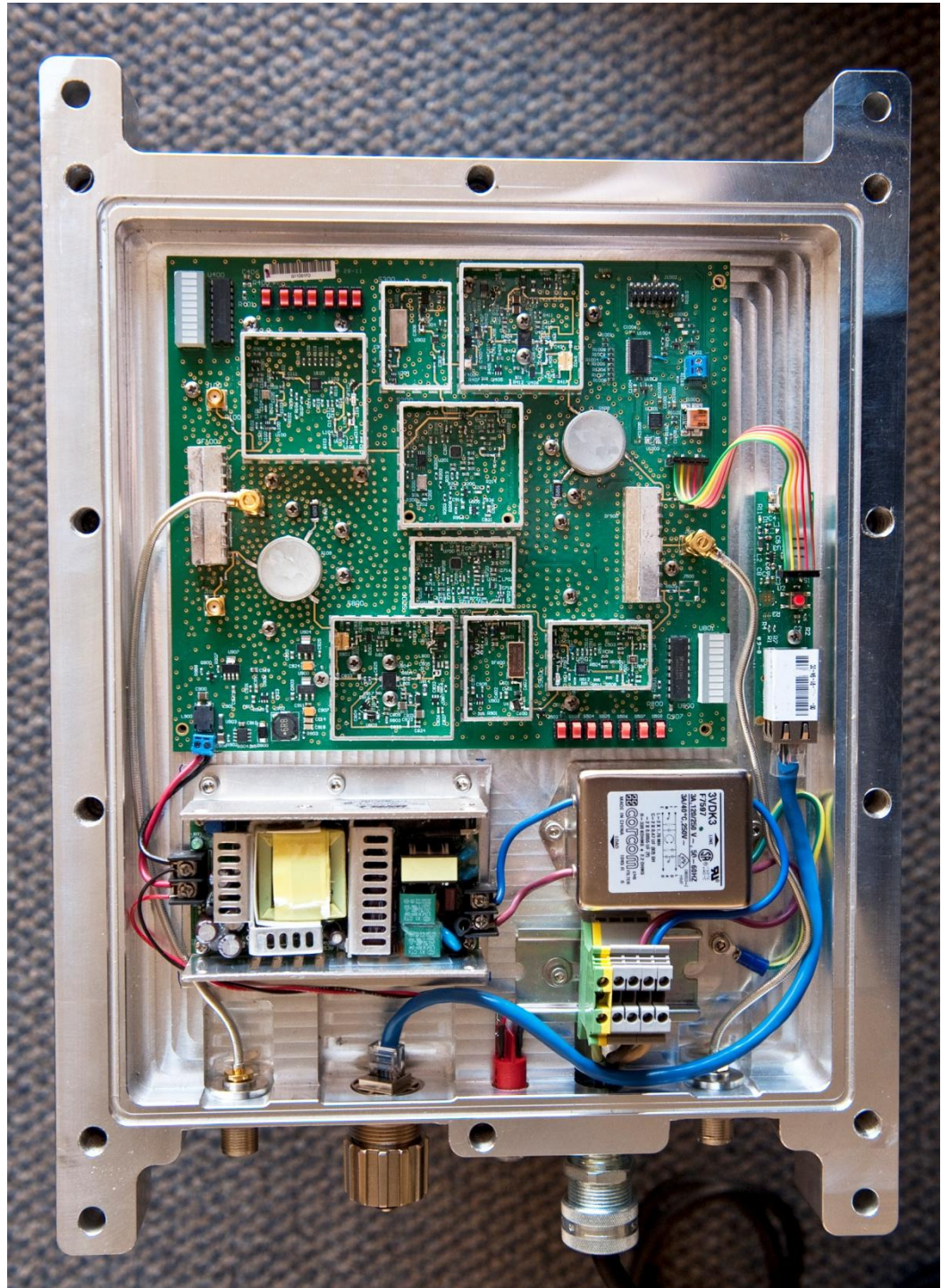
FRONT OF REPEATER WITH THE FRONT COVER REMOVED SHOWING INTERNALS