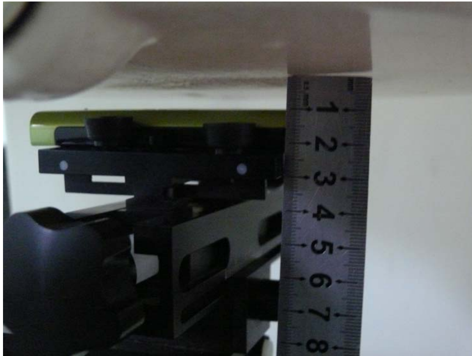
Picture 5: Back Side, the distance from handset to the bottom of the Phantom is 10mm