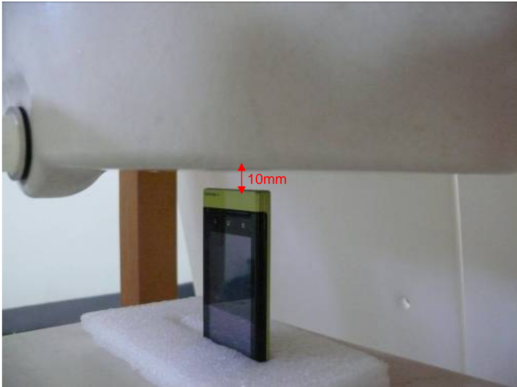
Picture 9: bottom edge, the distance from handset to the bottom of the Phantom is 10mm