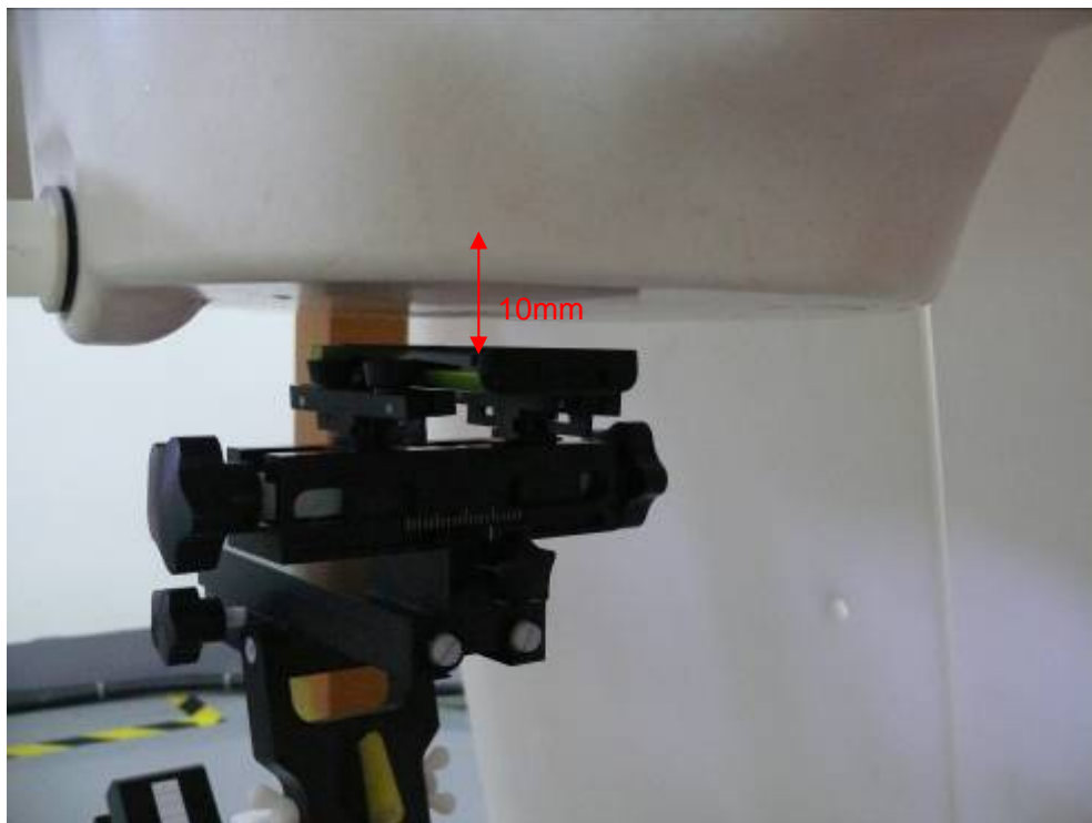
Picture 6: Front Side, the distance from handset to the bottom of the Phantom is 10mm