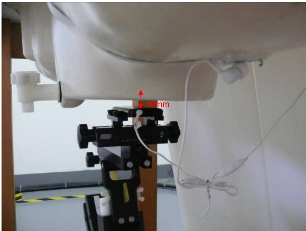
Picture 10: Body with earphone, Back Side, the distance from handset to the bottom of the Phantom is 10mm