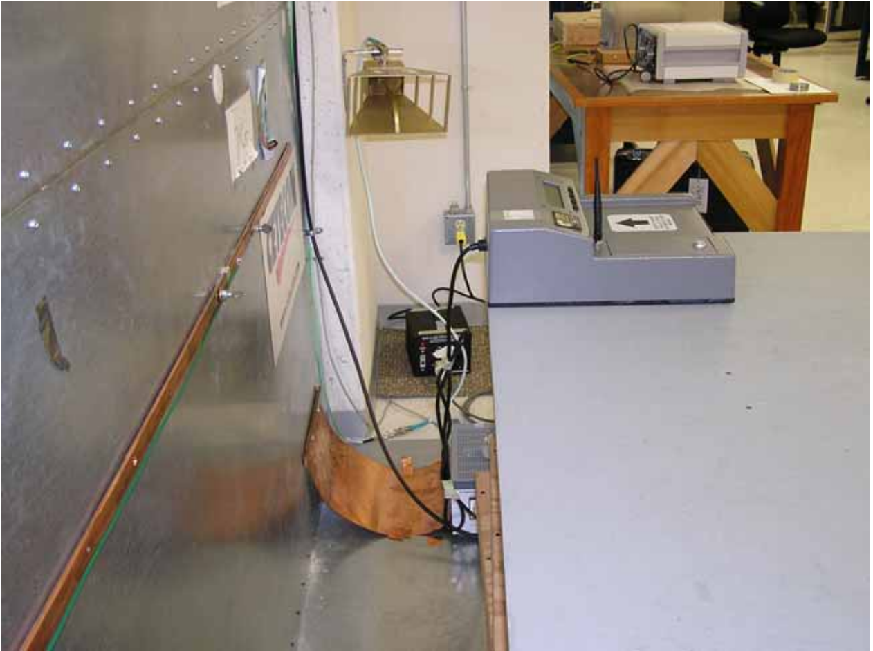
AC LINE CONDUCTION