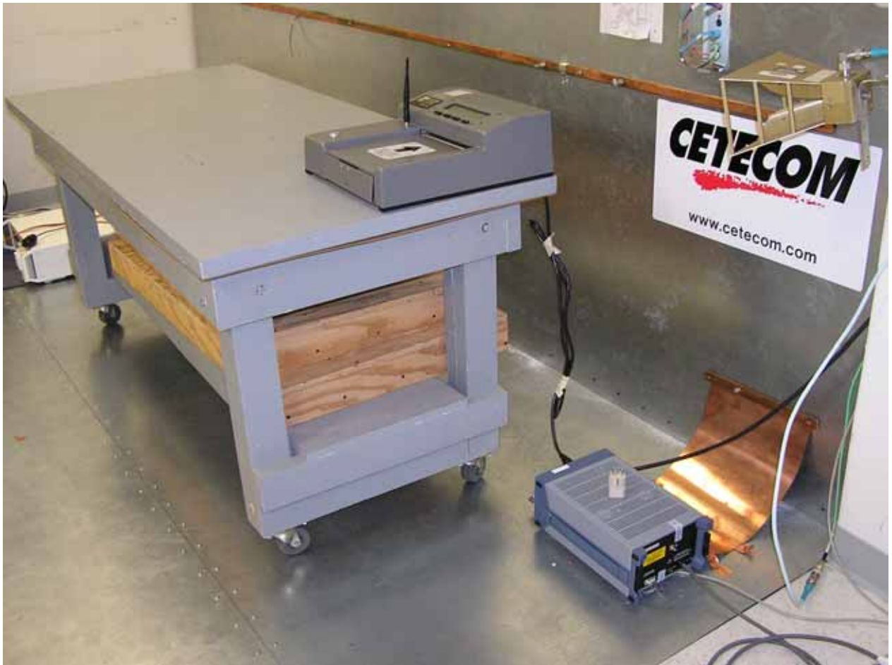
AC LINE CONDUCTION