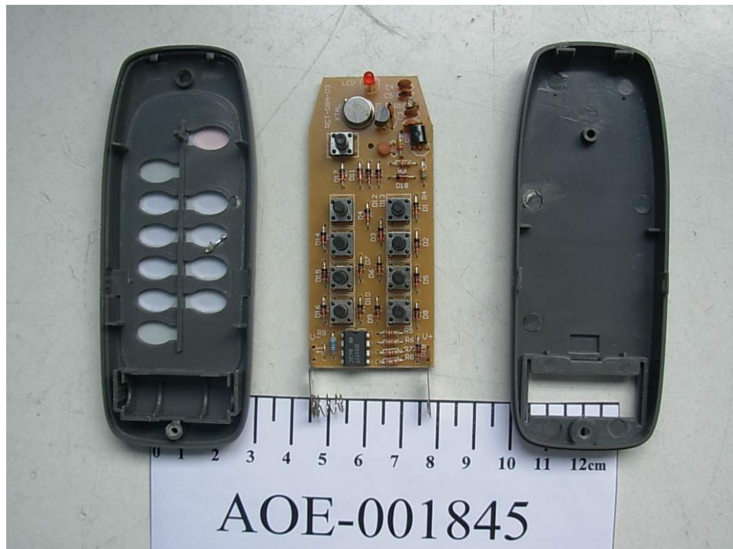
FIGURE 1 REMOTE CONTROL (M/N: RCT-08) COVER REMOVED