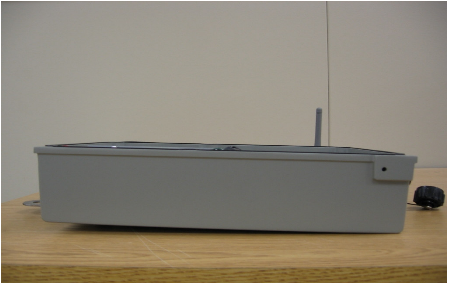
BRU - LEFT SIDE VIEW TOP COVER REMOVED