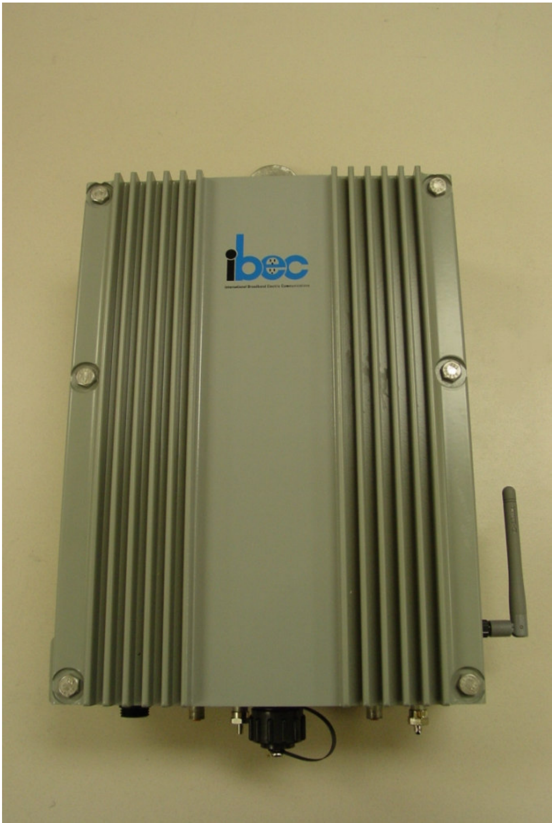
FULLY ASSEMBLED BRU TOP VIEW