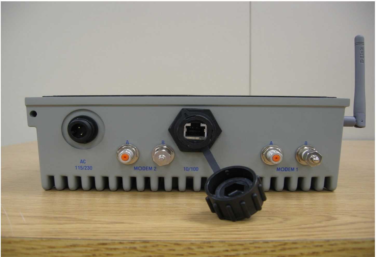
BRU - I/O END VIEW TOP COVER REMOVED