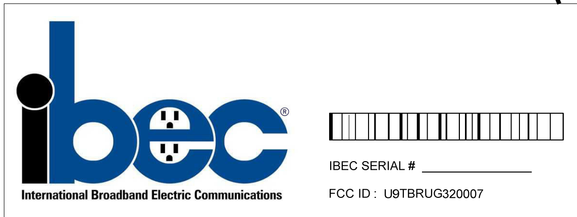
ENLARGED LABEL IMAGE