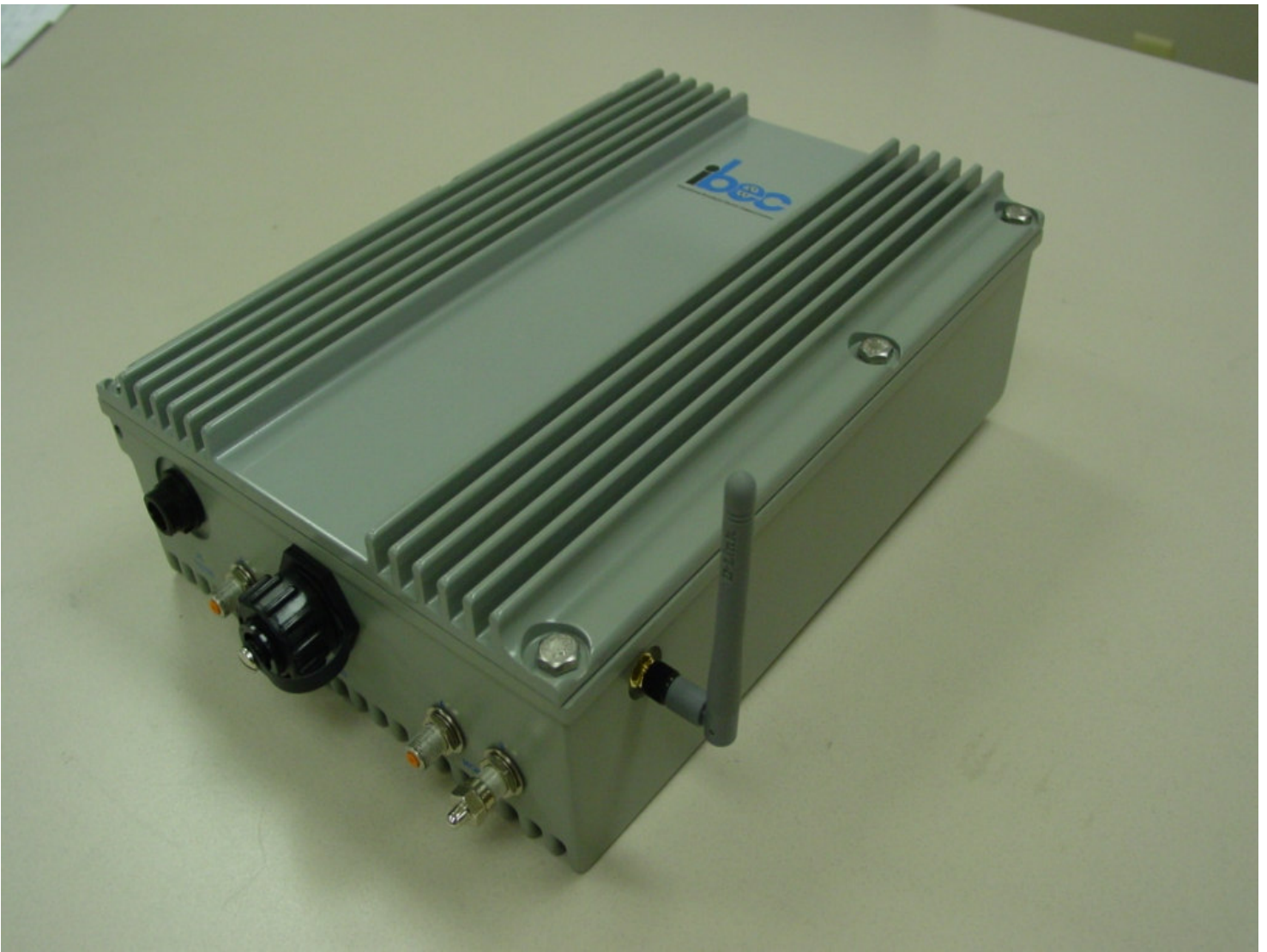
FULLY ASSEMBLED BRU ISOMETRIC VIEW