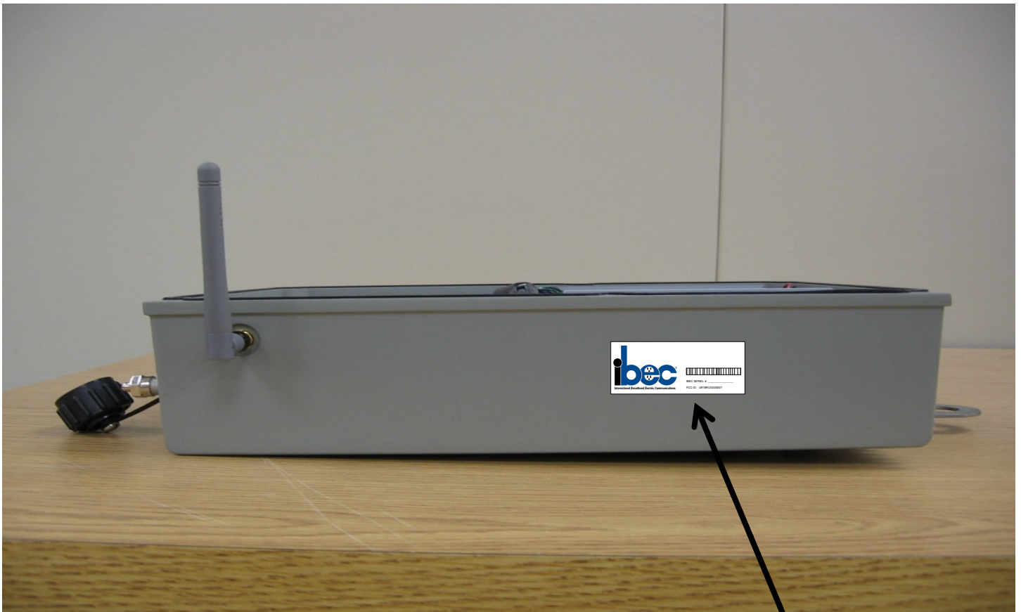
BRU - RIGHT SIDE VIEW TOP COVER REMOVED -Showing placement of FCC ID Label