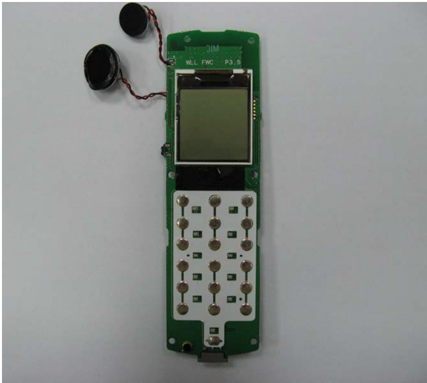
Picture1: Front view of PCB with screen