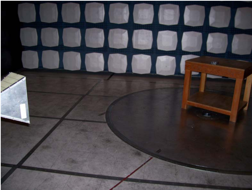
Figure 5: Above 1 GHz Emissions