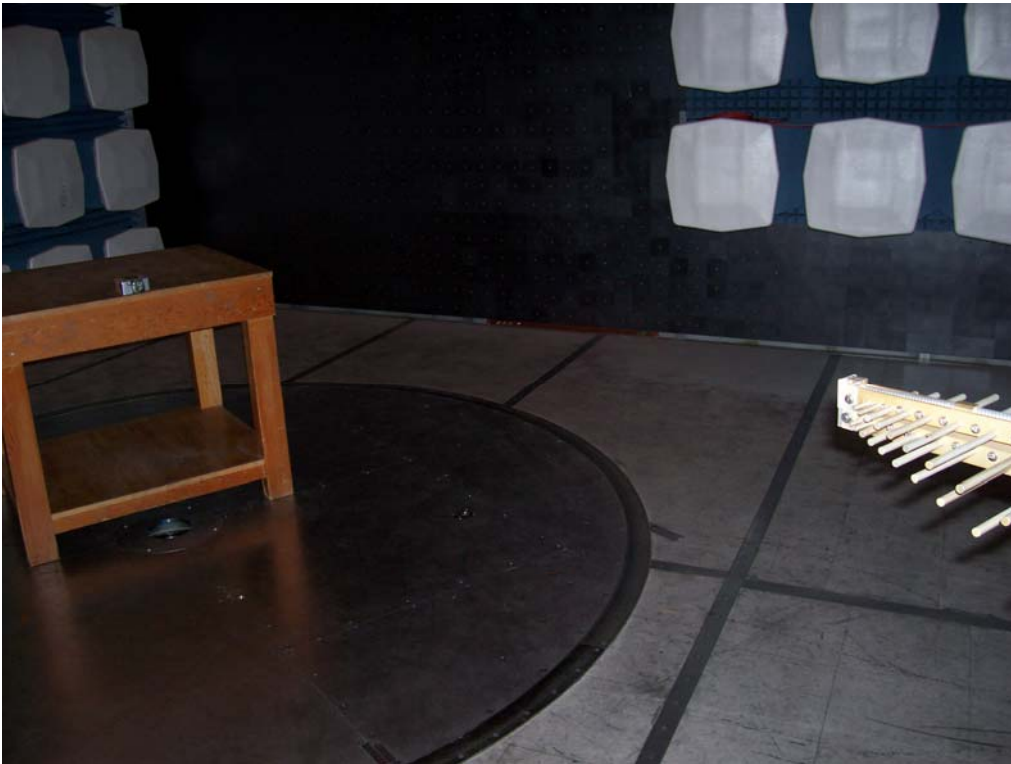
Figure 3: 30 MHz to 1 GHz Emissions