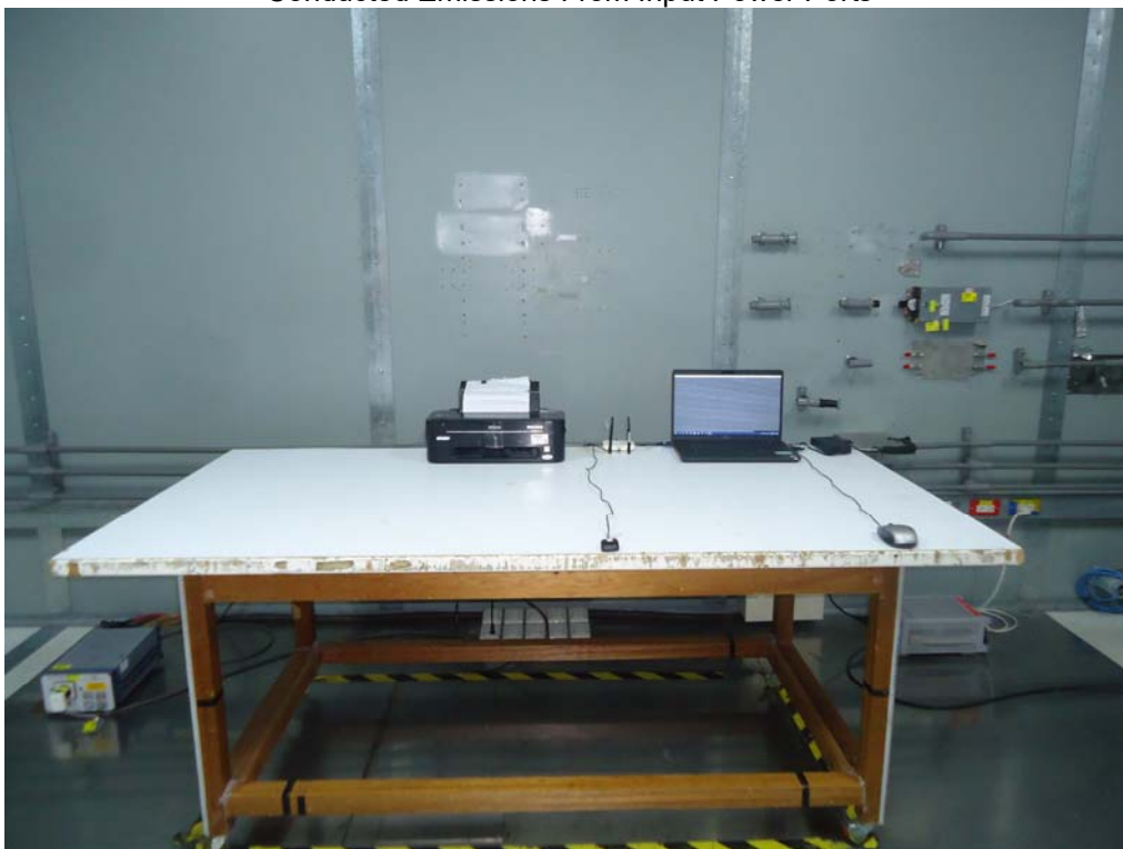
Conducted Emissions From Input Power Ports