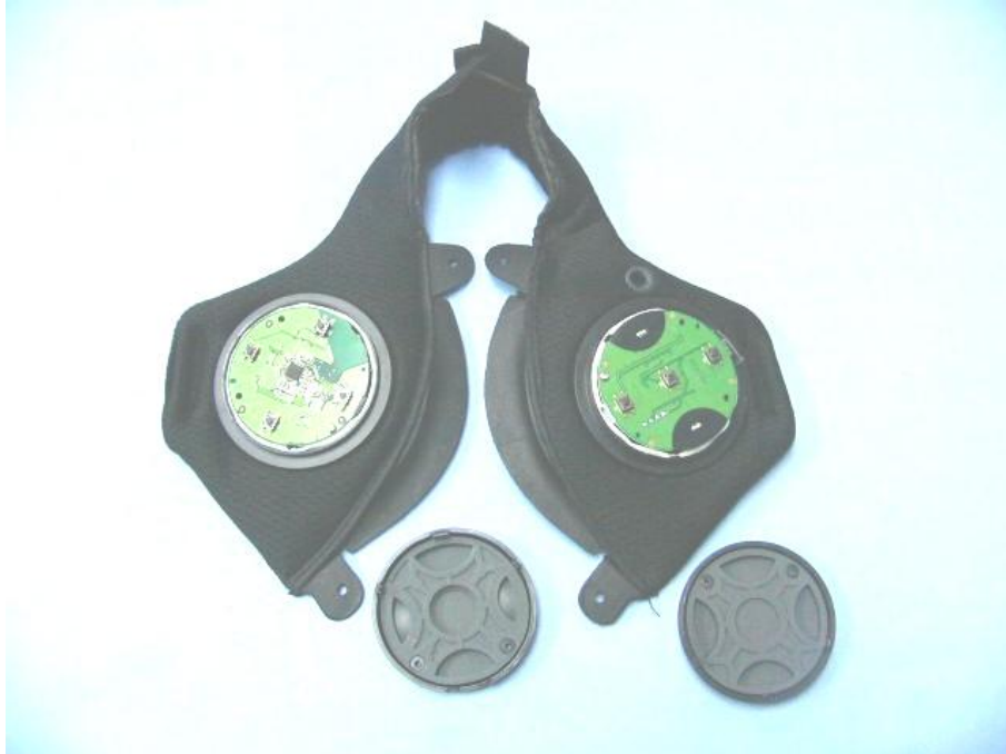
Main & RF board component side