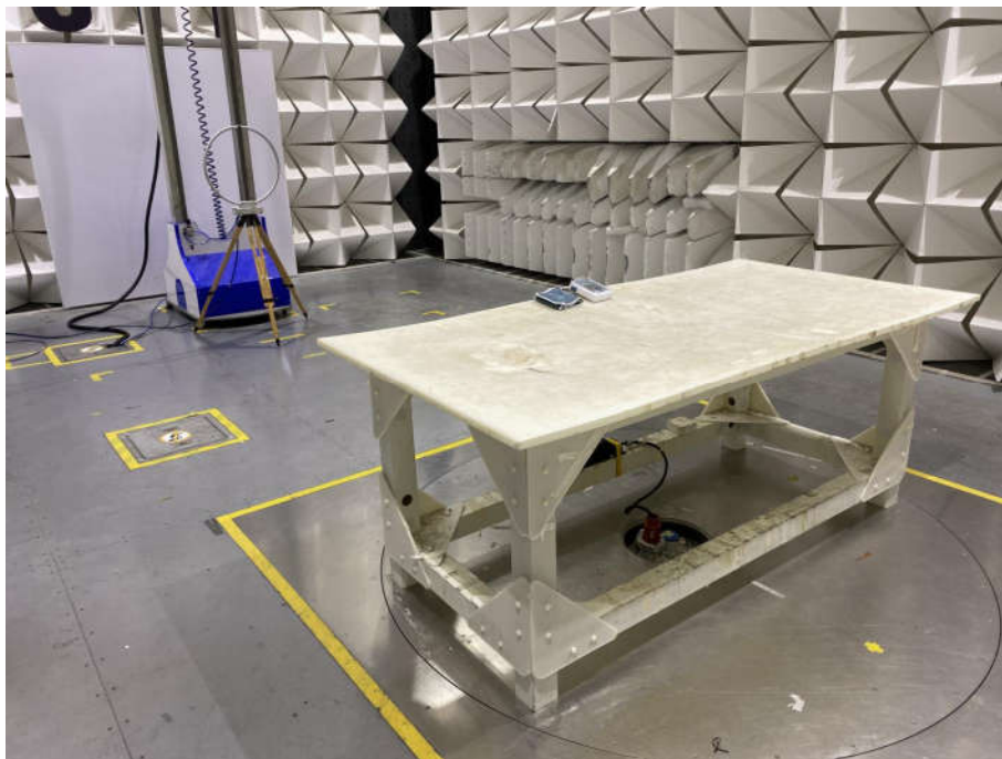
Radiated spurious emission Test Setup-1(Below 30M)