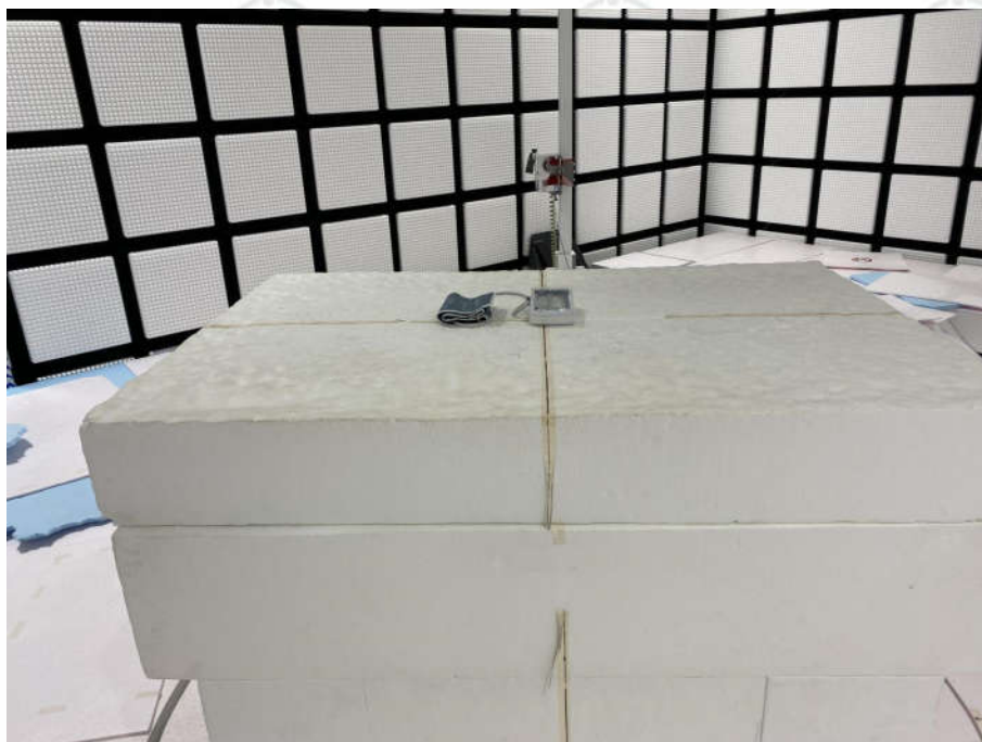
Radiated spurious emission Test Setup-3(Above 1G)