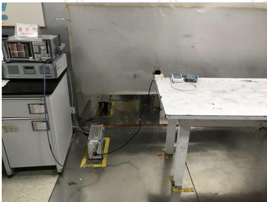
AC Conducted Emissions Test Setup