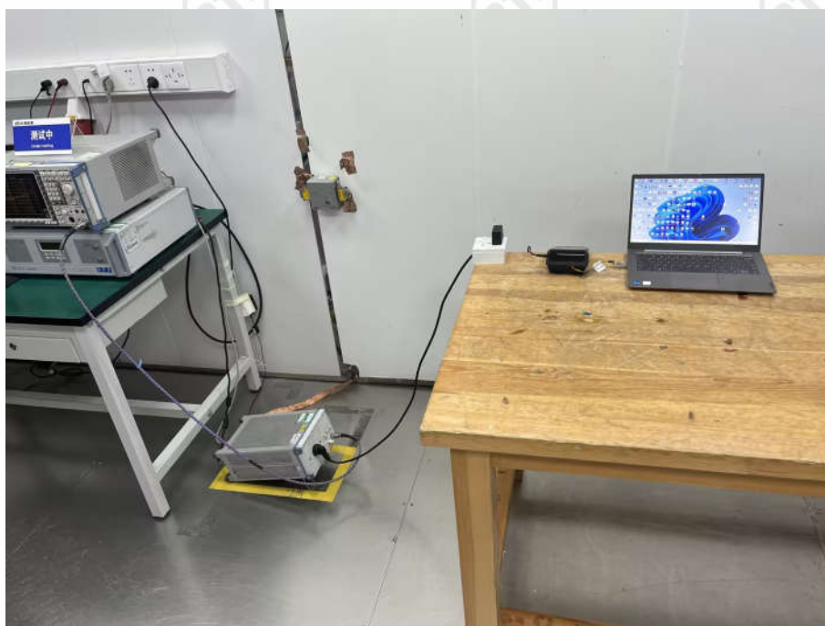
AC Power Line Conducted Emission Test Setup