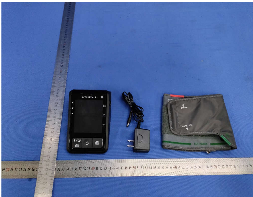
View of Product-01