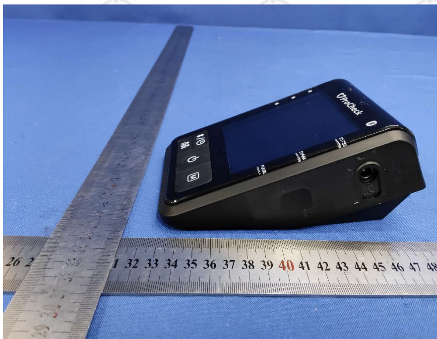
View of Product-04