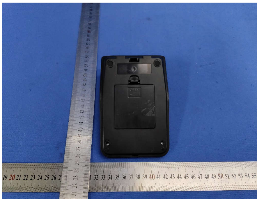
View of Product-07