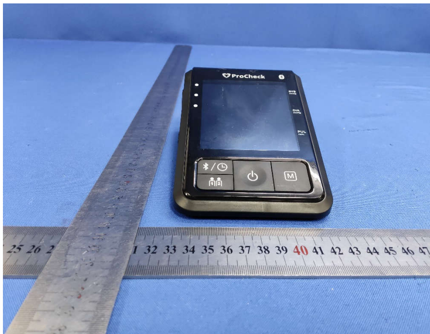
View of Product-03