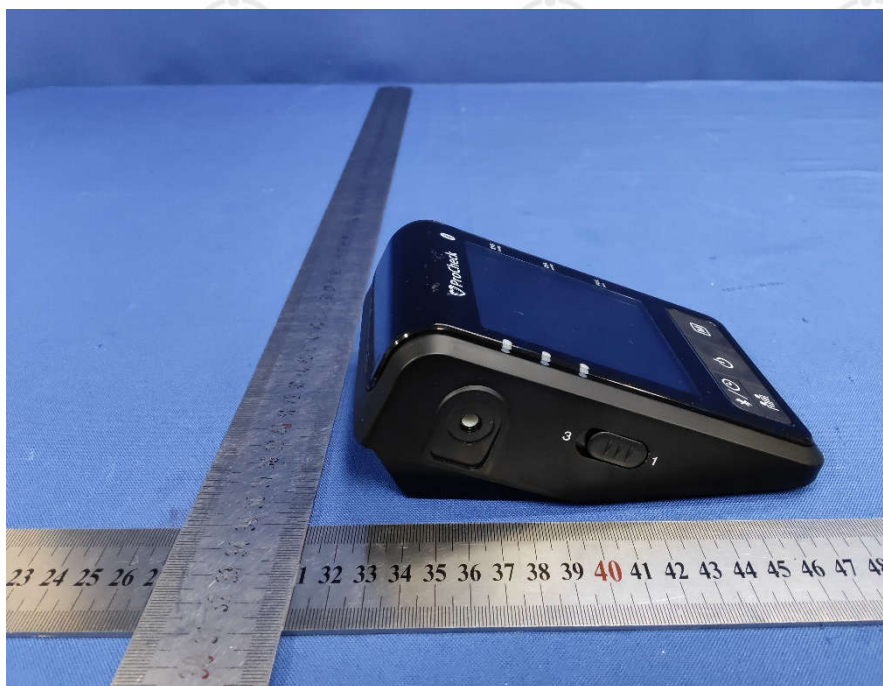
View of Product-06