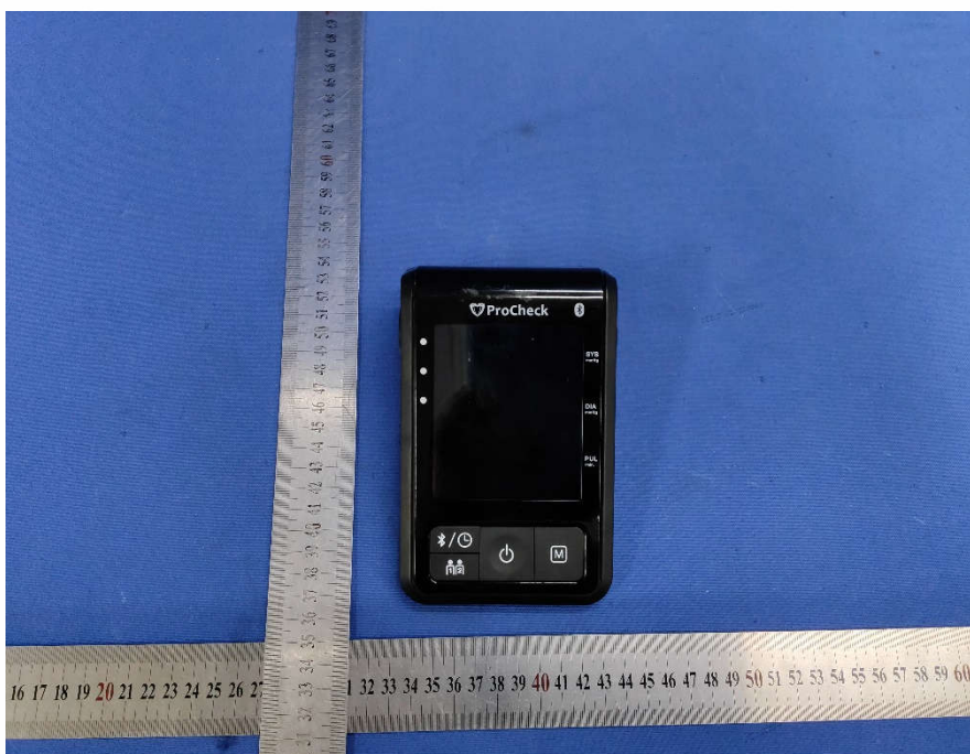
View of Product-02