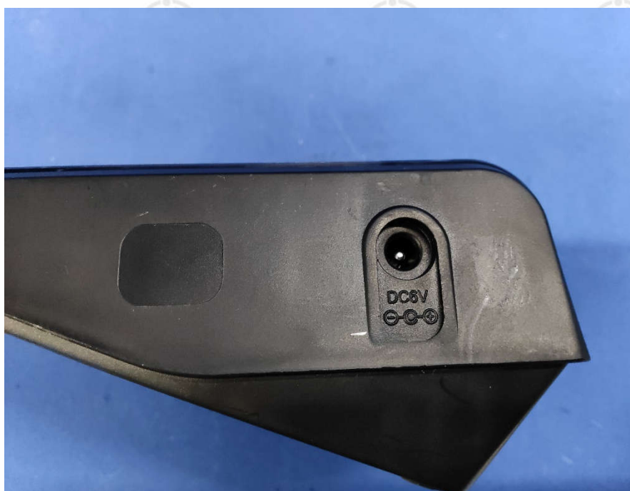
View of Product-08