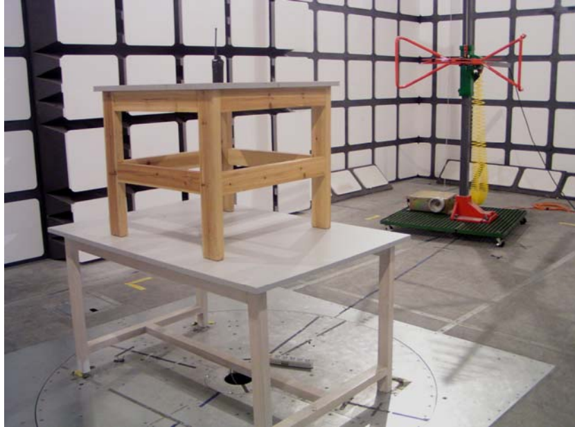
Radiated Emissions - Rear View (30-1000 MHz)