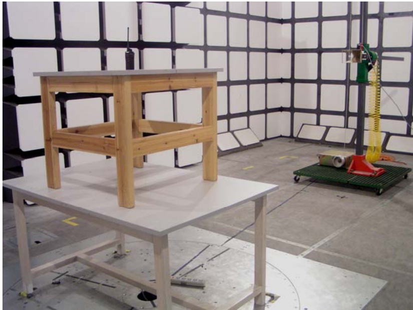
Radiated Emissions - Rear View (Above 1000 MHz)