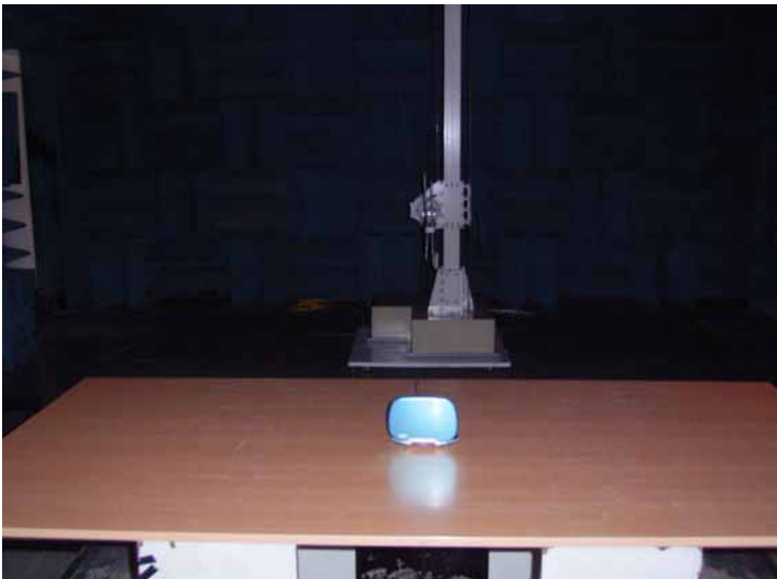
BACK VIEW OF RADIATED MEASUREMENT