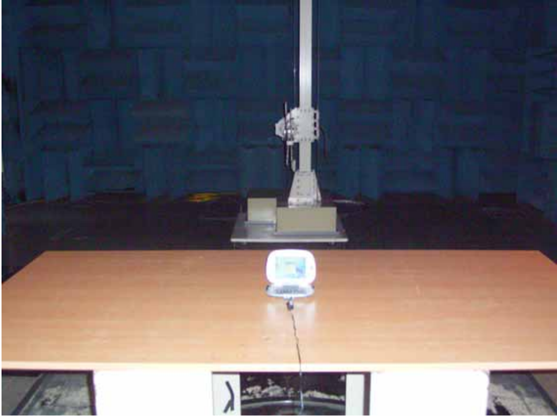
FRONT VIEW OF RADIATED MEASUREMENT