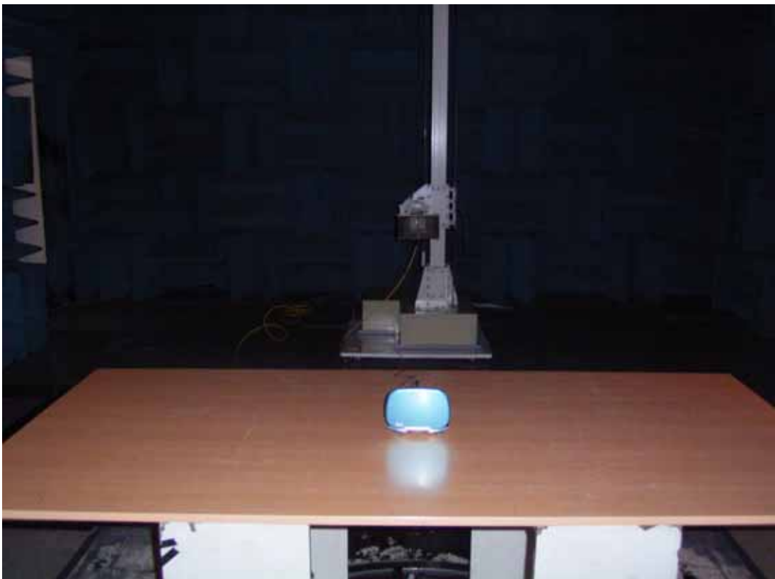
BACK VIEW OF RADIATED MEASUREMENT