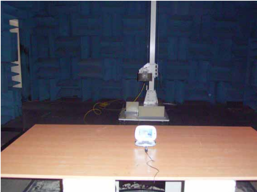
FRONT VIEW OF RADIATED MEASUREMENT