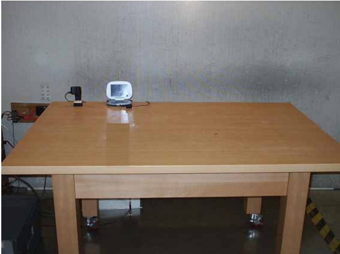
FRONT VIEW OF CONDUCTED MEASUREMENT