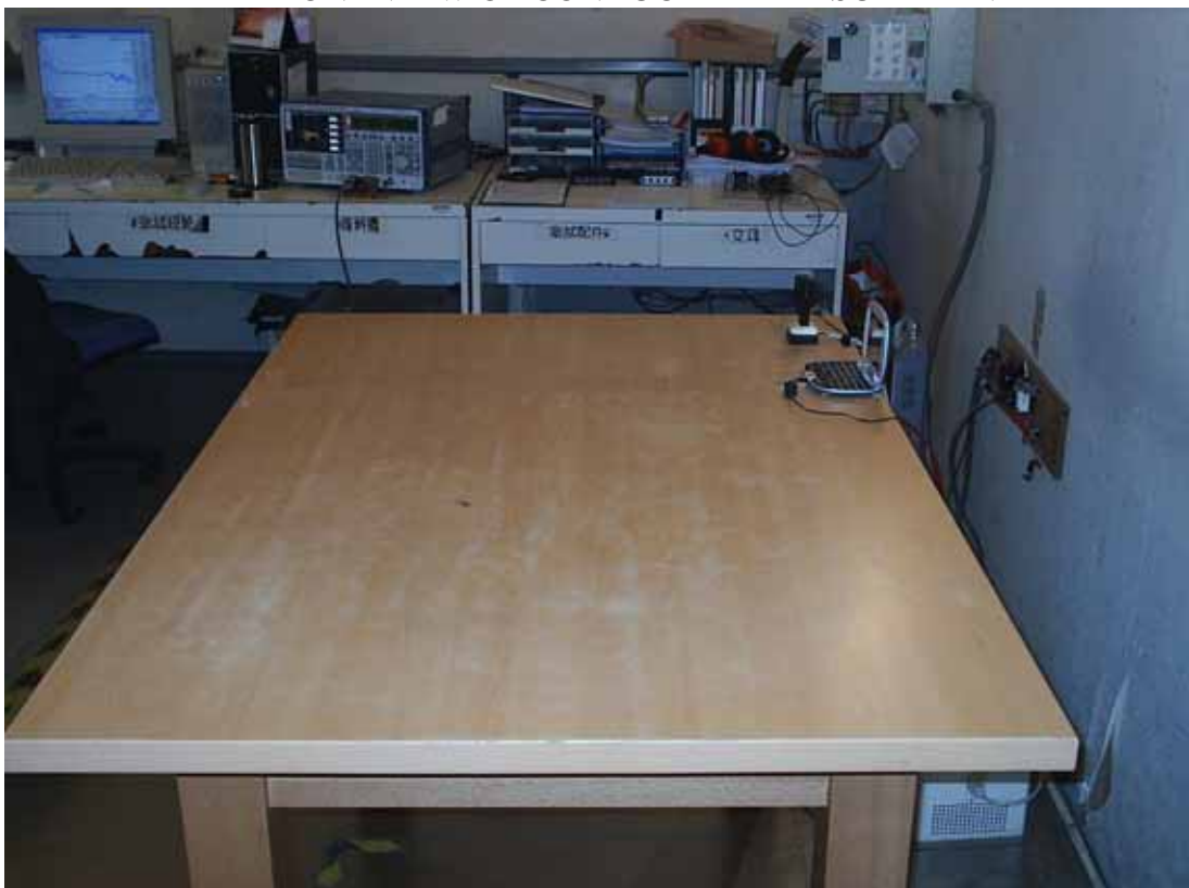
BACK VIEW OF CONDUCTED MEASUREMENT