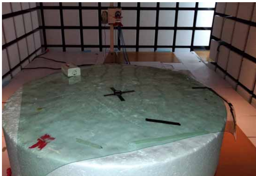
EUT on Lie