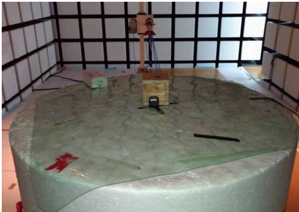
EUT on Stand