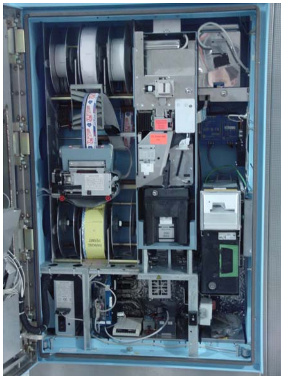
View on the inside of the door and view inside of the EUT: Ticket Vending Machine TVM Expert for New Jersey