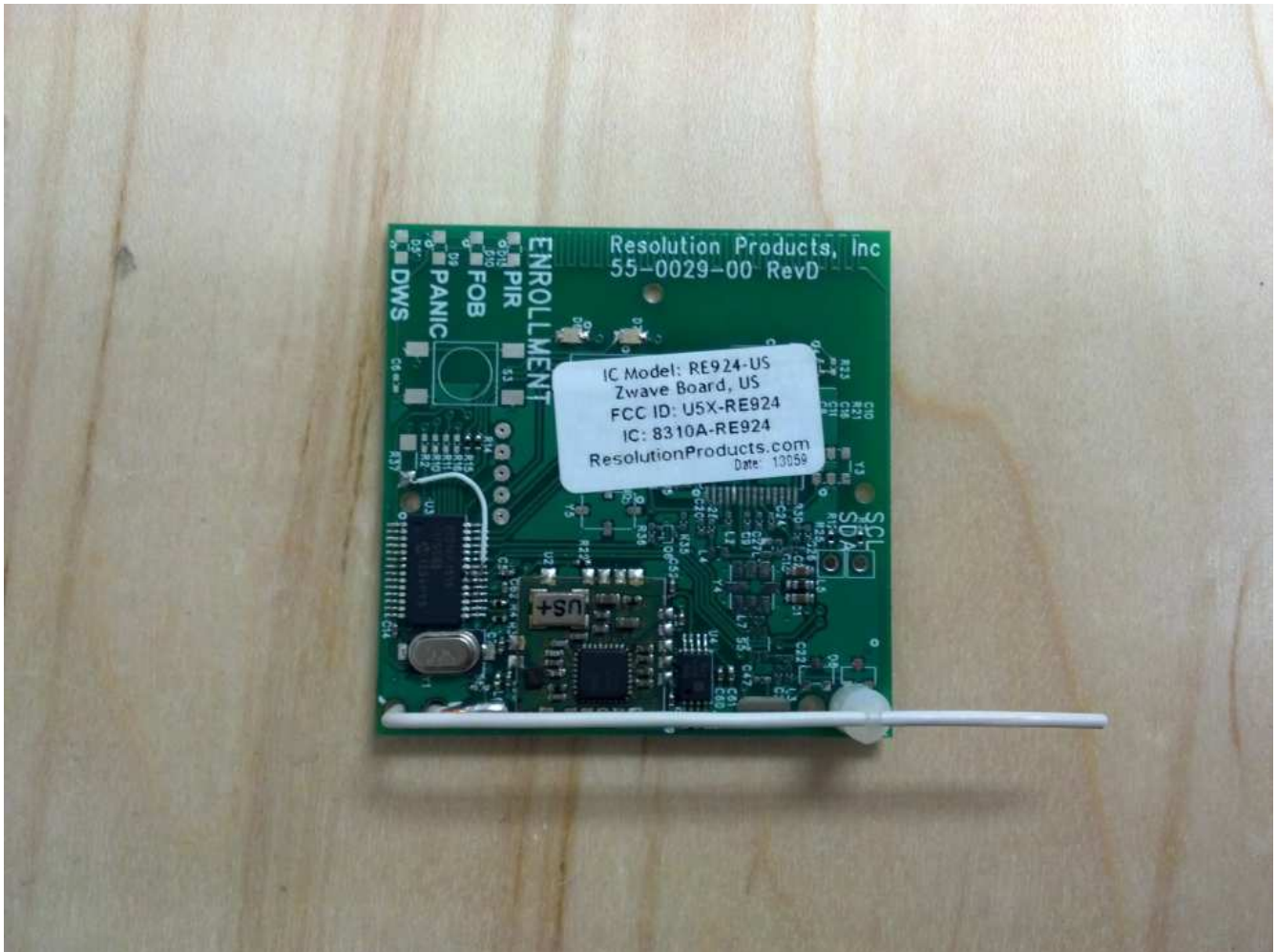
Exhibit C RE924 Internal Photos