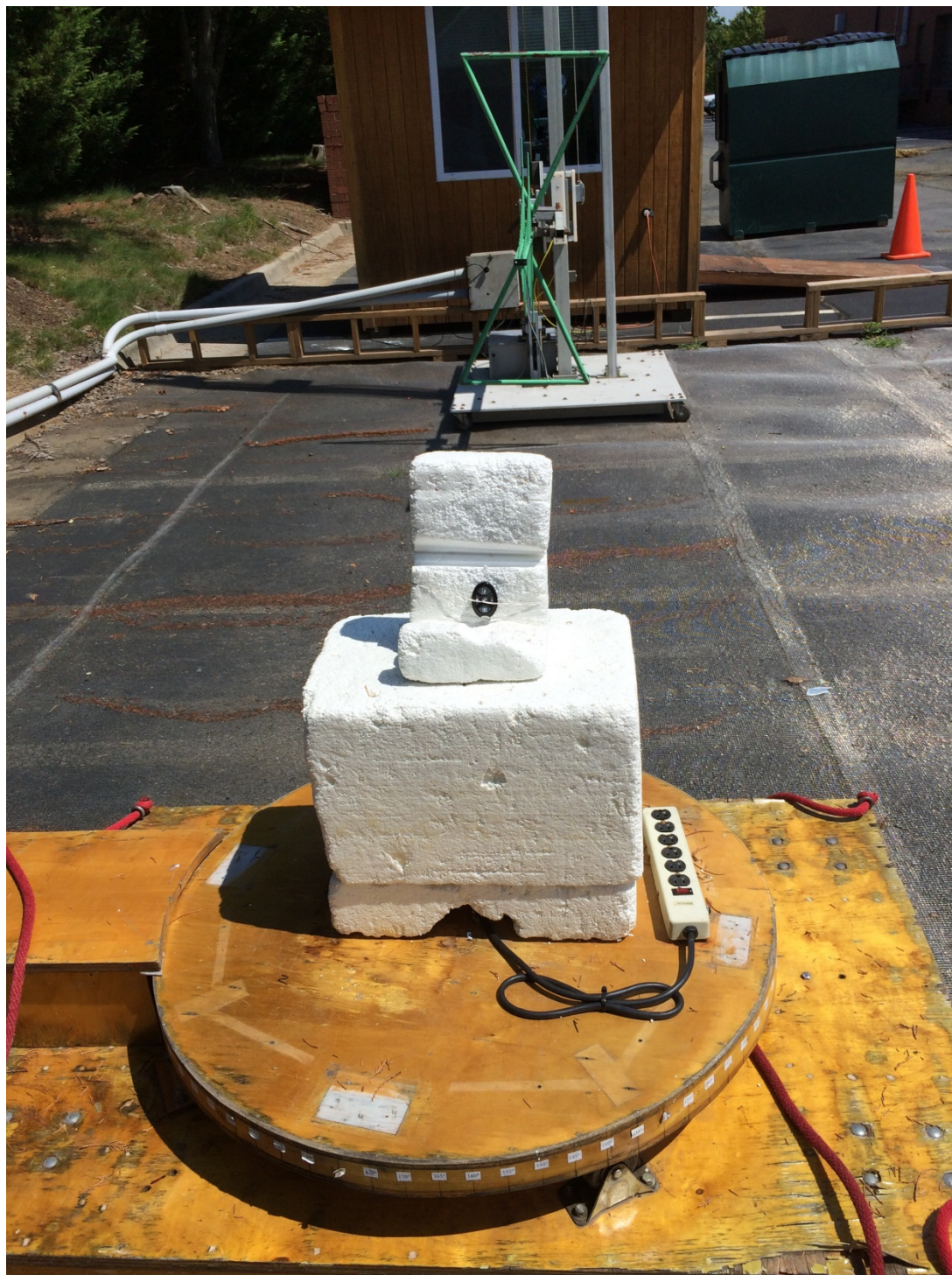
Radiated Emissions (Less Than 1 GHz)