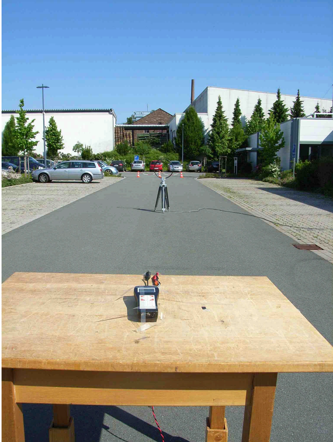
70363emi_ff9.jpg: Test set-up final radiated emission (H-Field)

Annex A of test report R70363FCC 2 nd version EUT: DETECTOR III Manufacturer: FAG Industrial Services GmbH