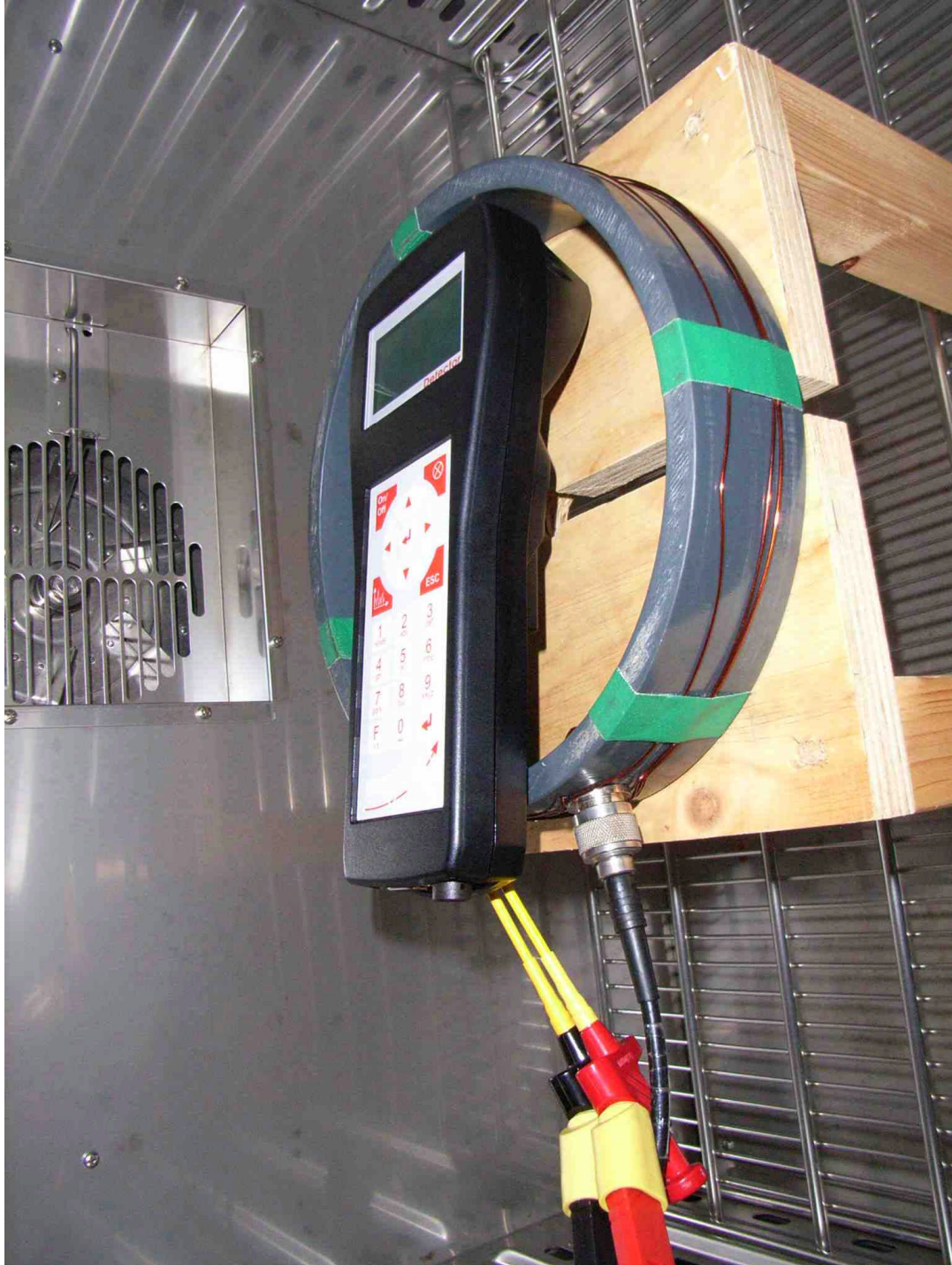
70363clima2.jpg: Test set-up climatic chamber

Annex A of test report R70363FCC 2 nd version EUT: DETECTOR III Manufacturer: FAG Industrial Services GmbH