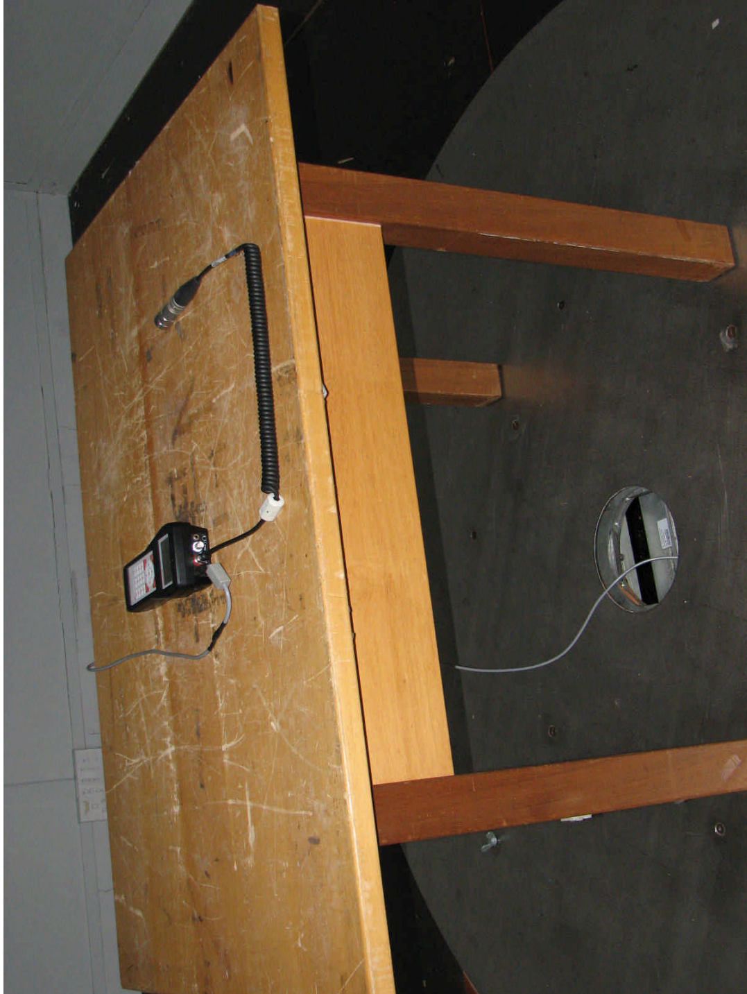
70363emi_24.jpg: Test set-up final radiated emission (E-Field)

Annex A of test report R70363FCC 2 nd version EUT: DETECTOR III Manufacturer: FAG Industrial Services GmbH