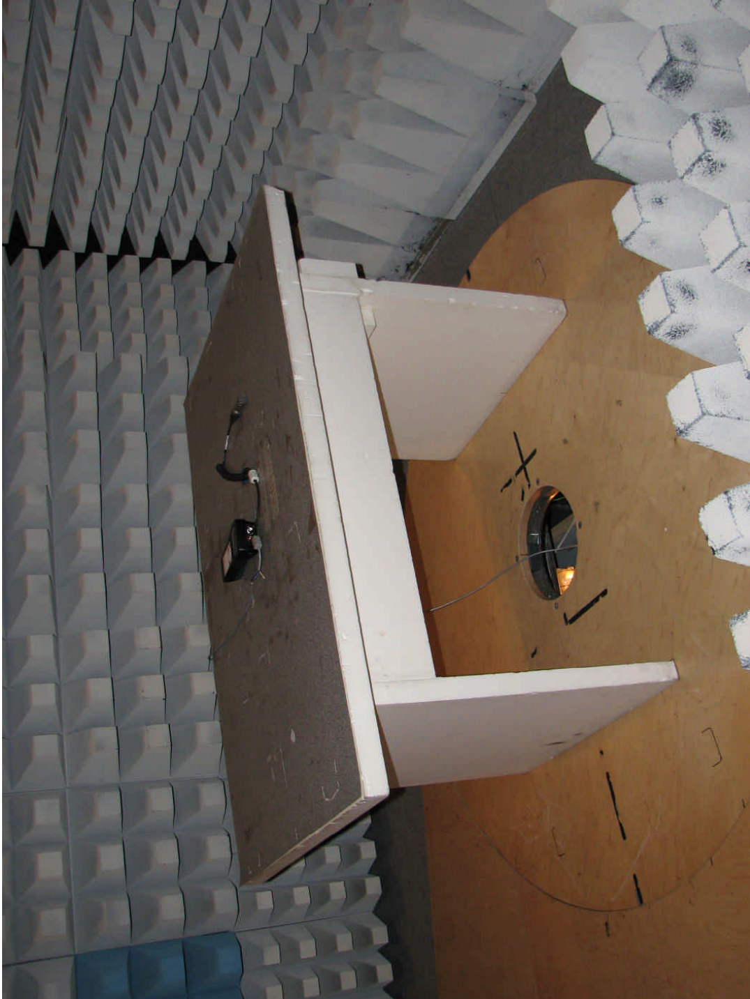
70363emi22.jpg: Test set-up preliminary radiated emission (E-Field)

Annex A of test report R70363FCC 2 nd version EUT: DETECTOR III Manufacturer: FAG Industrial Services GmbH