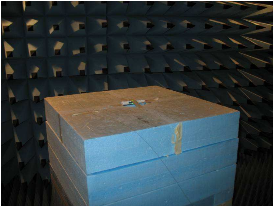
Radiated spurious emission above 1 GHz, Radio Chamber: