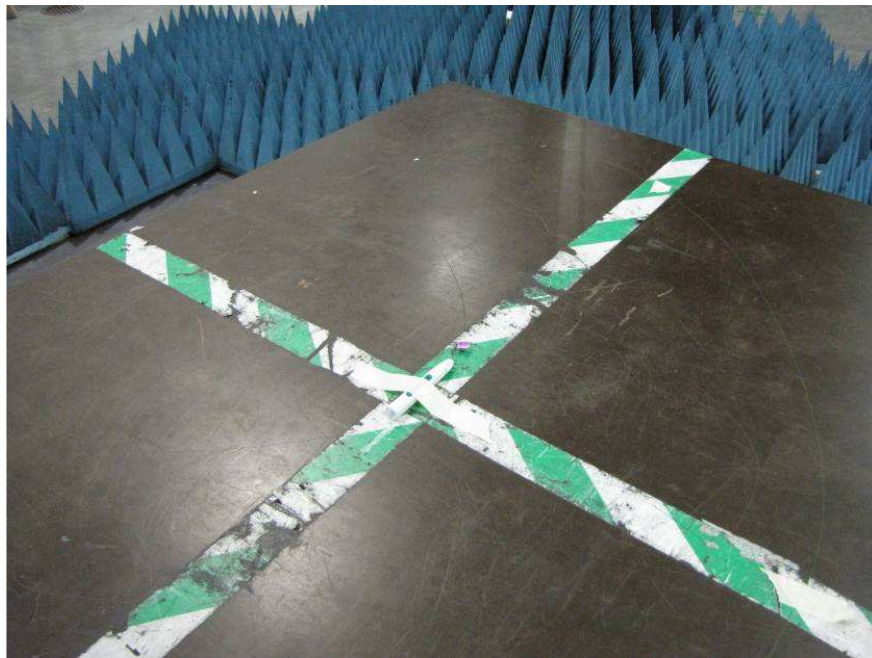
Transmitter field strength