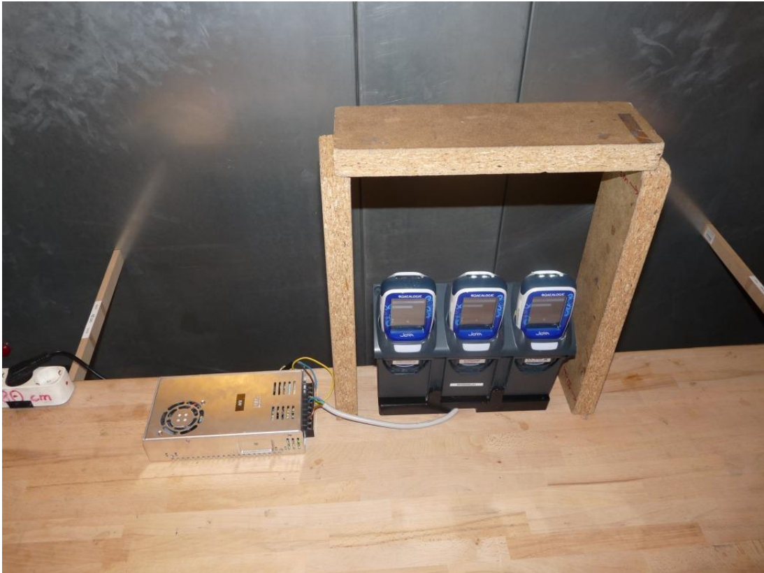
Photo 1: Test setup for conducted measurements unintentional radiator (§15) 3-slot-cradle setup