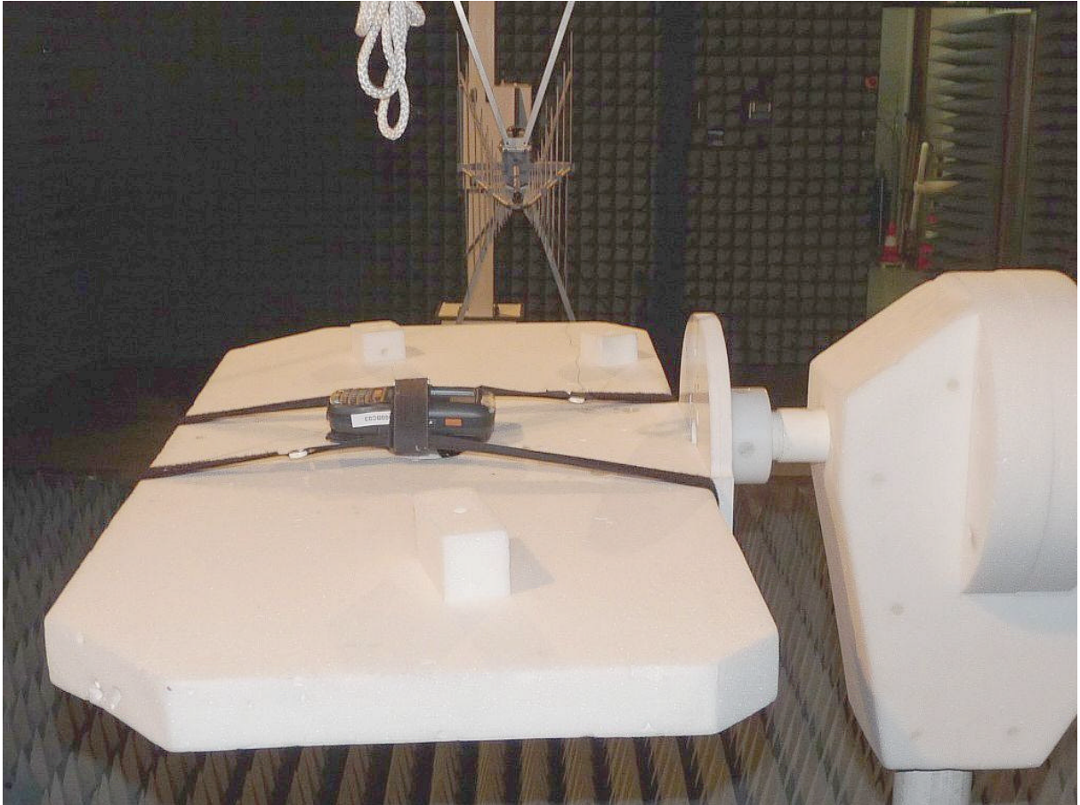
Photo 1: Test setup for radiated measurements (Enclosure, above 1 GHz)

Detailed photos of the OUT are declared as confidential.