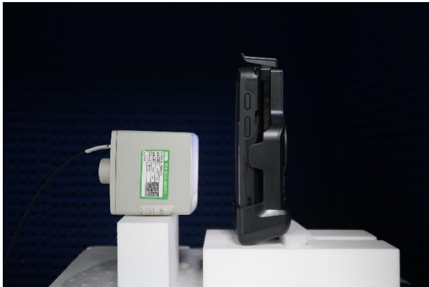
Front at 5 cm separation distance

The equipment under test was placed on a desk inside of shield room. The isotropic field probe was used to measure the field strength for 6 EUT surfaces, RF exposure evaluation at 5 cm surrounding the device and 5cm away from the surface, the separation distance is maintained between EUT and the center of the field probe. (The Probe to shell is 8 mm)