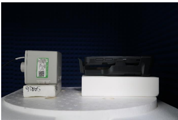
Top Side at 5 cm separation distance