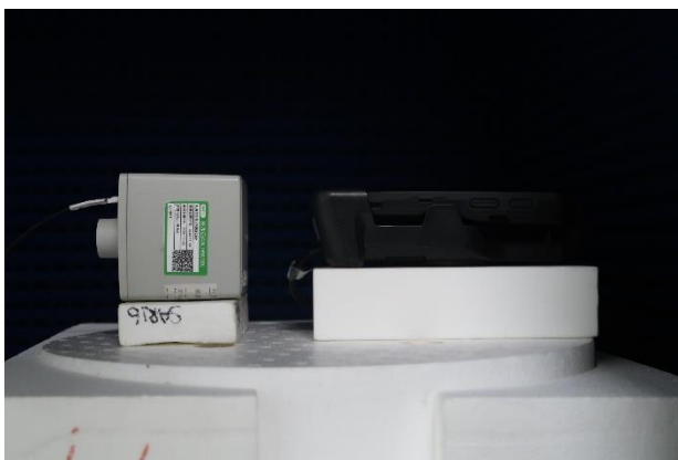
Bottom Side at 5 cm separation distance