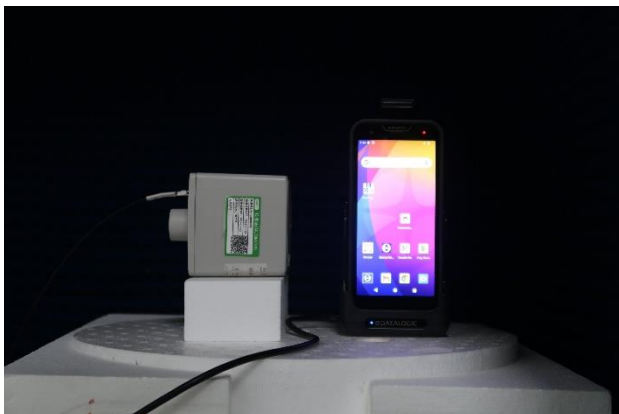
Left Side at 5 cm separation distance