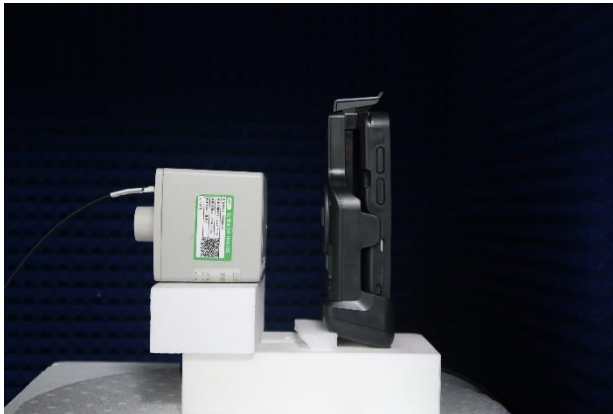
Back at 5 cm separation distance