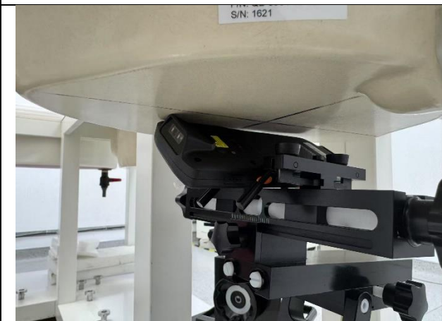
Figure 13 Back Tilt Side mode