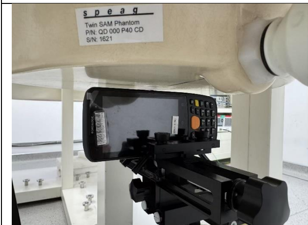
Figure 9 Right Side mode