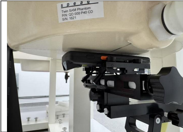
Figure 5 Front Side mode

According to the antenna position, the Body SAR is tested at the following 6 test positions all with the distance =5mm between the EUT and the phantom bottom: