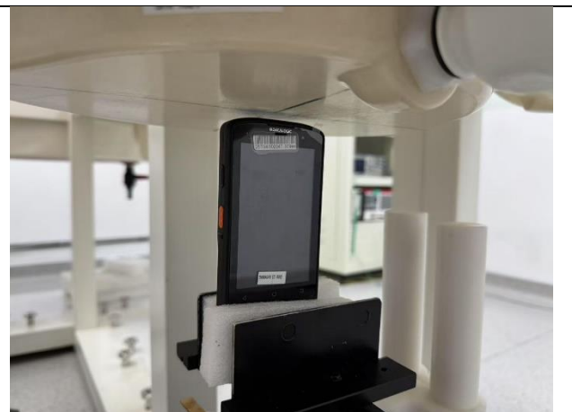
Figure 10 Top Side mode