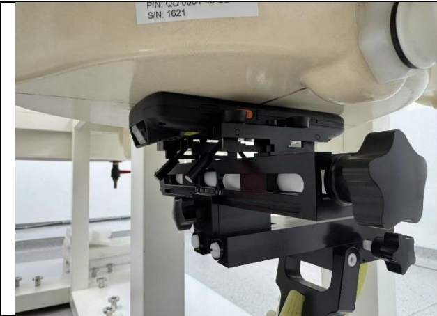
Figure 11 Front Side mode

According to the antenna position, the Limb SAR is tested at the following 6 test positions all with the distance =0mm between the EUT and the phantom bottom: