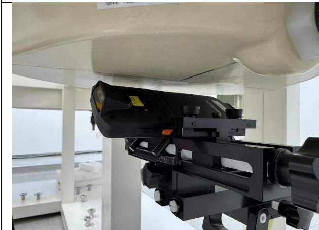
Figure 7 Back Tilt Side mode