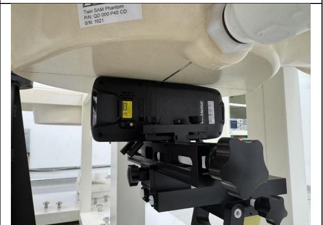
Figure 14 Left Side mode