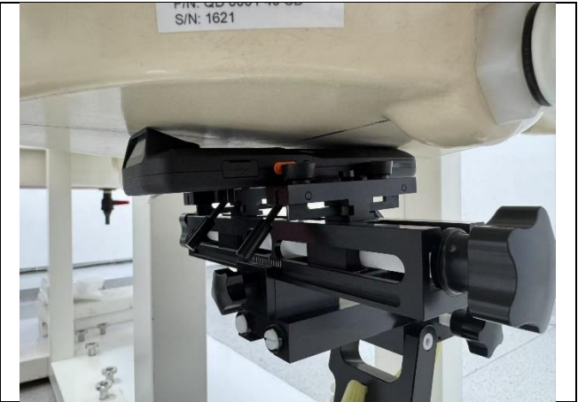
Figure 12 Back Side mode