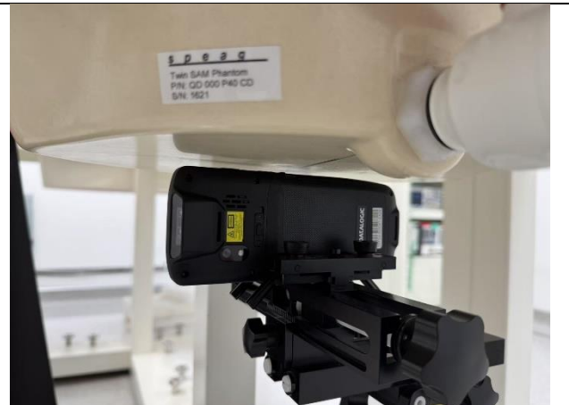
Figure 8 Left Side mode