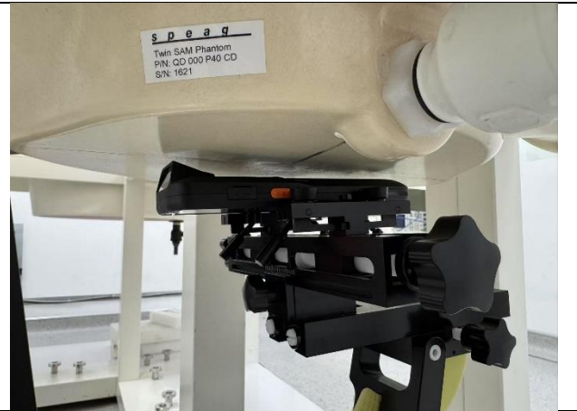
Figure 6 Back Side mode