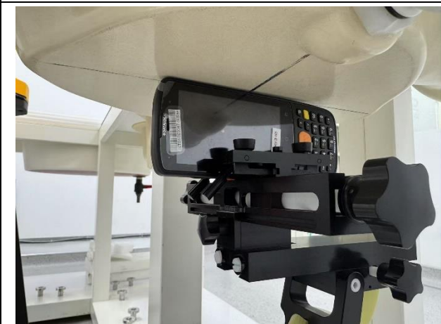
Figure 15 Right Side mode