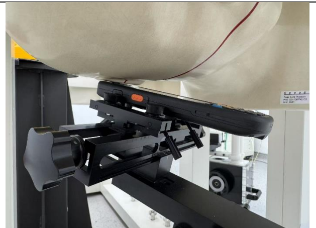
Figure 4 Right Tilt 15° mode