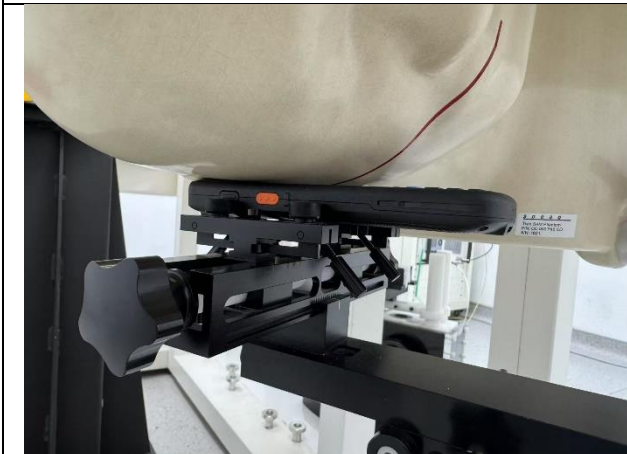
Figure 3 Right Touch mode