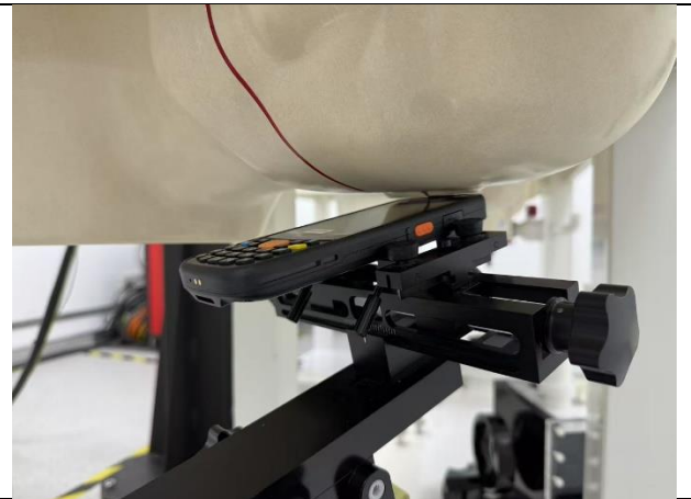
Figure 2 Left Tilt 15° mode