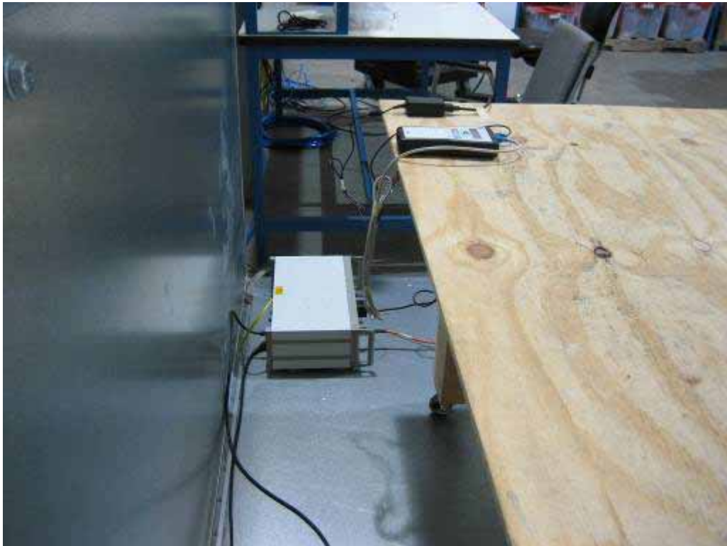
Ac Line Conducted Emission Rear