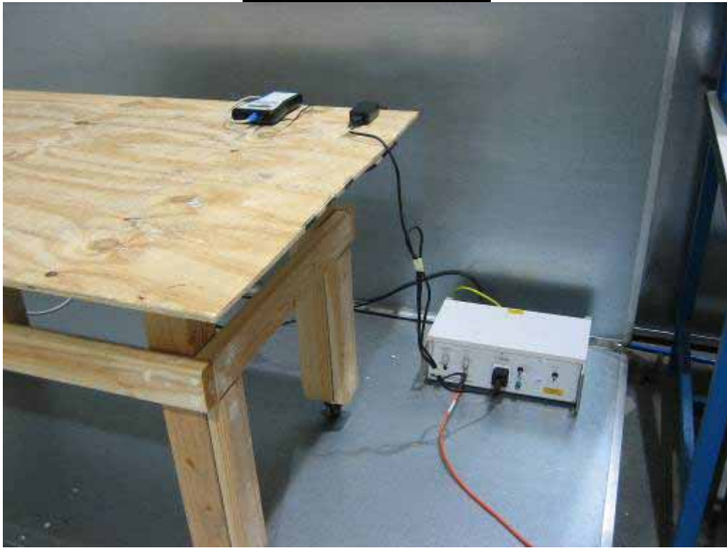
Ac Line Conducted Emission Front