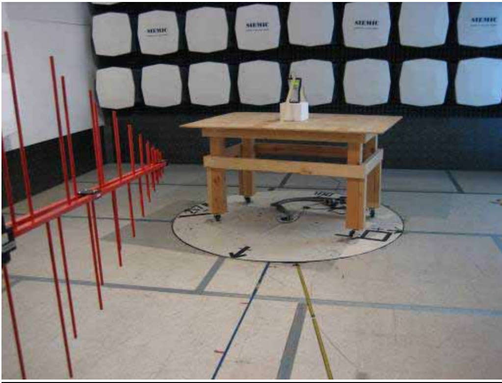
Radiated Emission > 30\text{MHz}