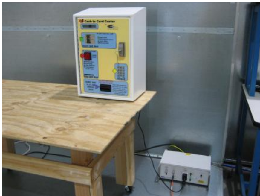
Conducted Emissions Voltage Setup with Cash-to-Card System