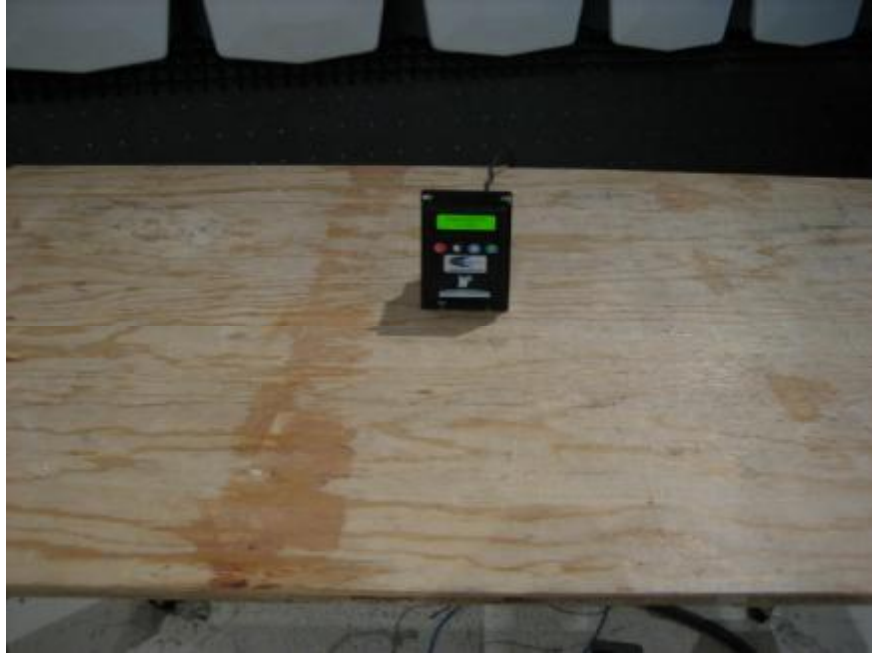
Close-Up setup with SmartKit II System