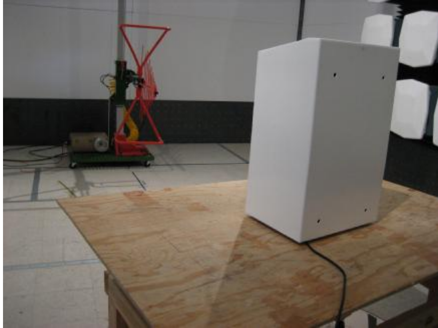
Radiated Emission setup > 30 MHz with Cash-toCard System