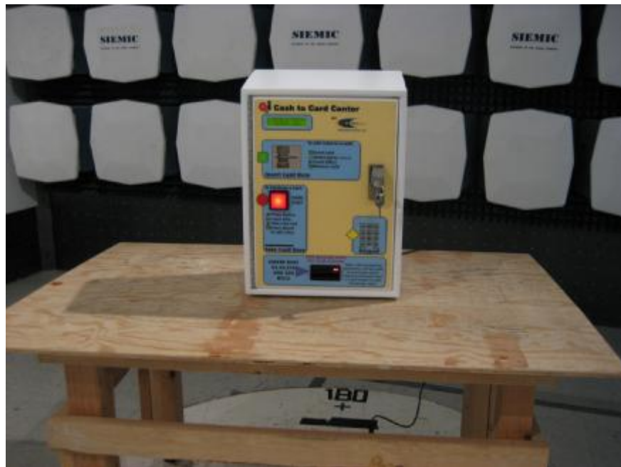
Close-Up setup with Cash-to-Card System