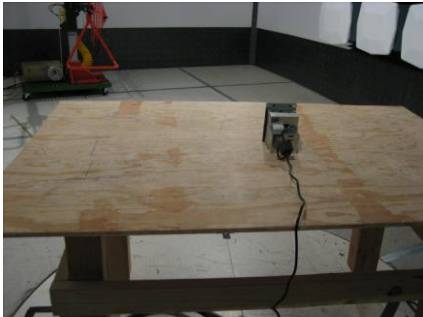
Radiated Emission setup > 30 MHz with SmartKit II System