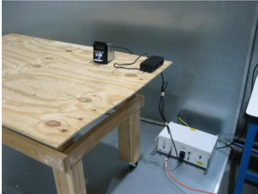
Conducted Emissions Voltage Setup with SmartKit II System