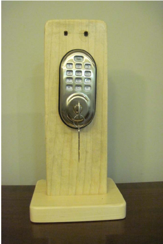
Lock with key pad and physical key shown