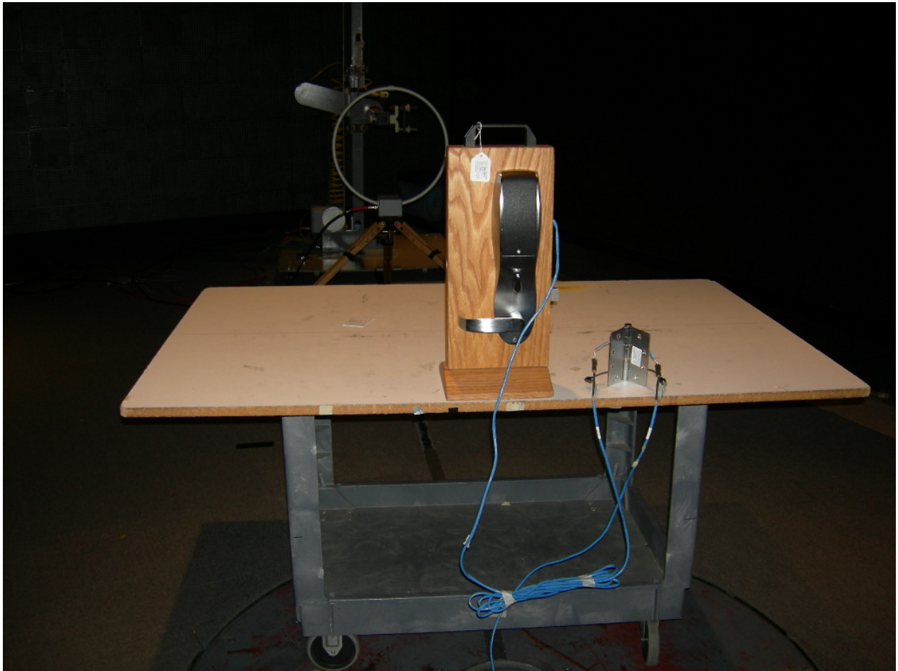
Figure 1: S1 Series – Radiated Emissions