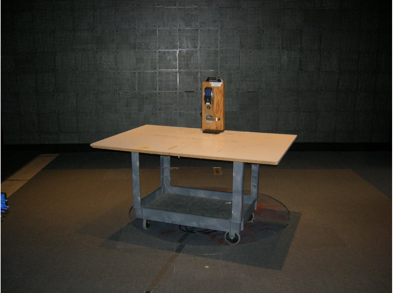
Figure 6: S2 Series – Radiated emissions