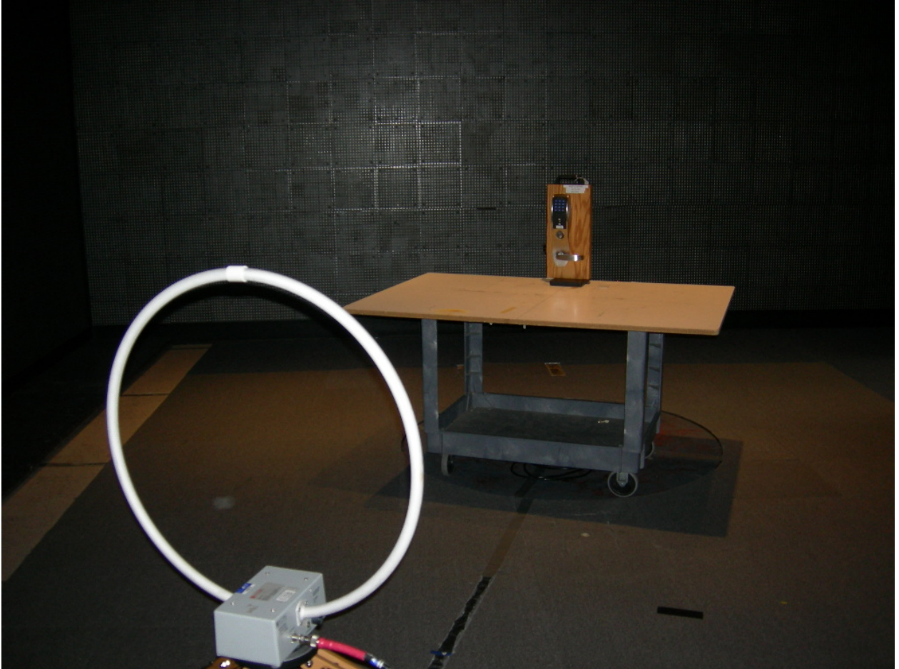
Figure 5: S2 Series – Radiated emissions