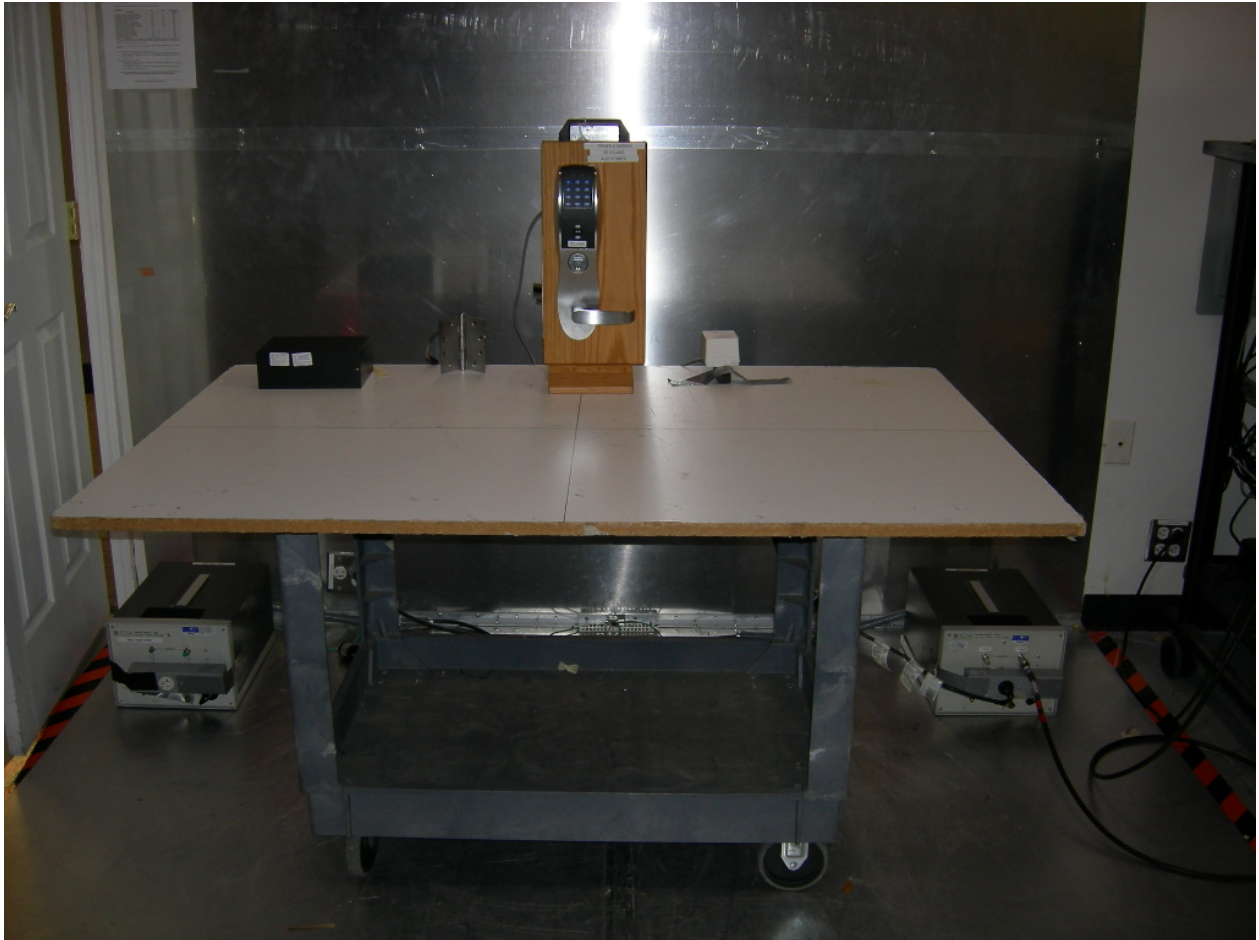
Figure 10: S2 Series – AC Power Line Conducted emissions