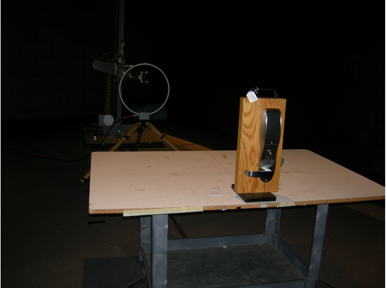
Figure 4: S2 Series – Radiated emissions