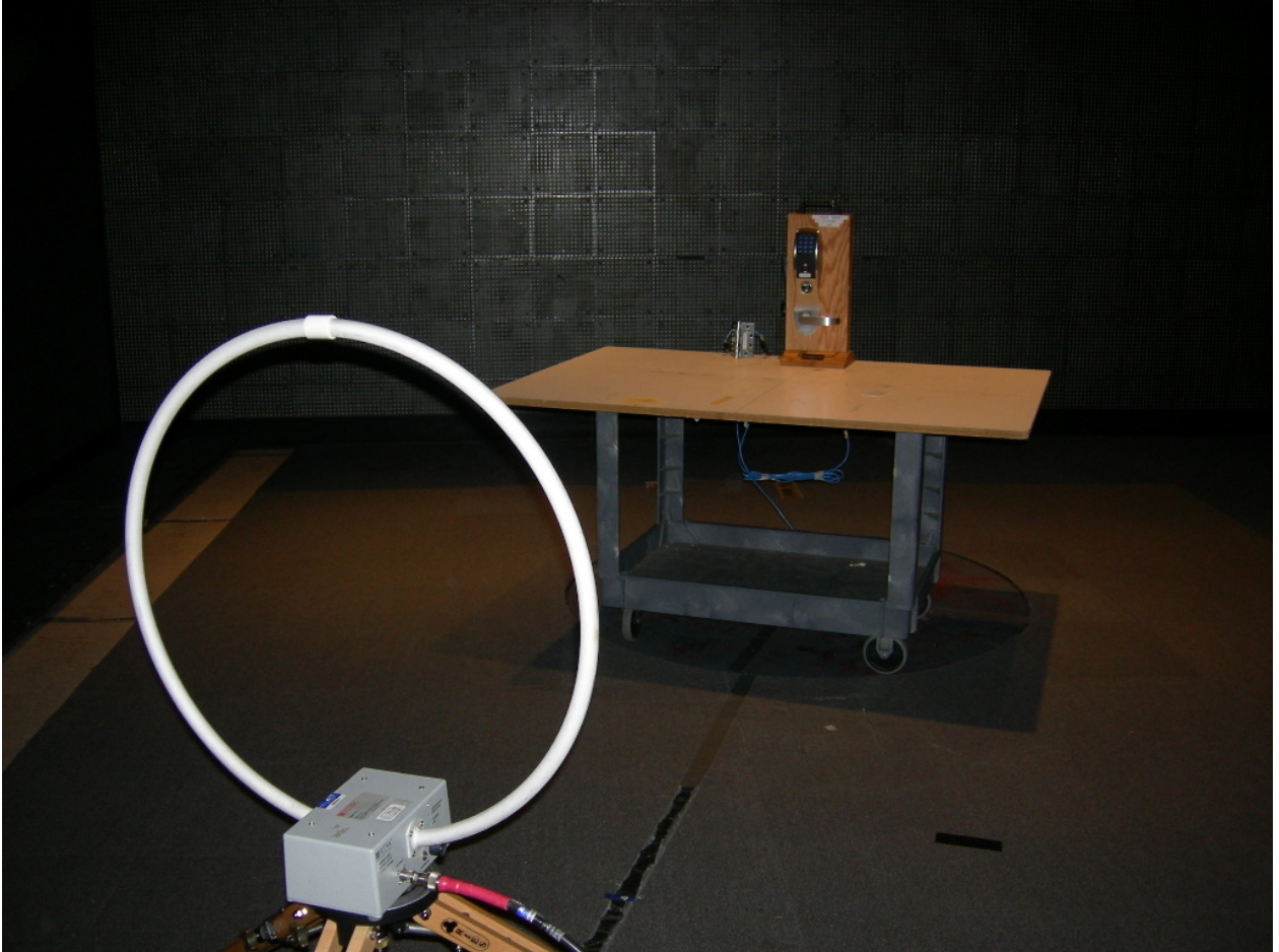
Figure 2: S1 Series – Radiated Emissions