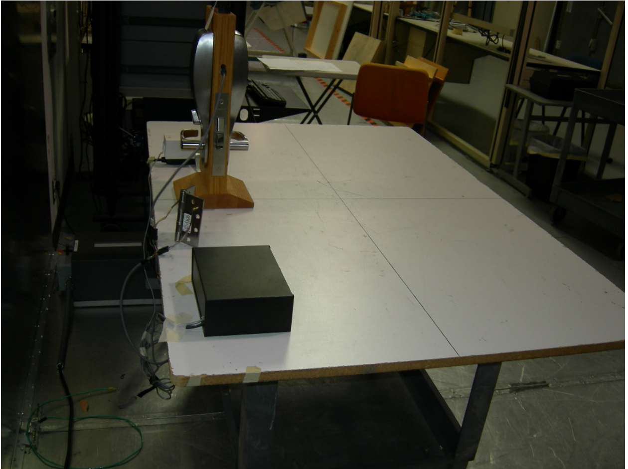
Figure 11: S2 Series – AC Power Line Conducted emissions