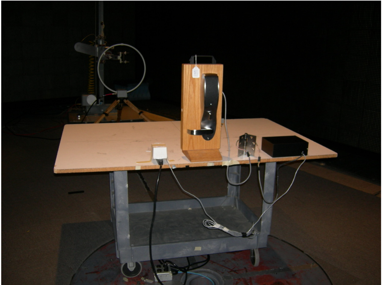
Figure 7: S2 Series – Radiated emissions