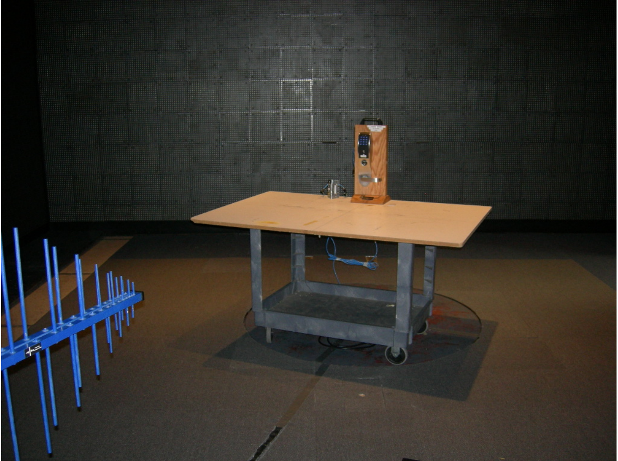
Figure 3: S1 Series – Radiated Emissions