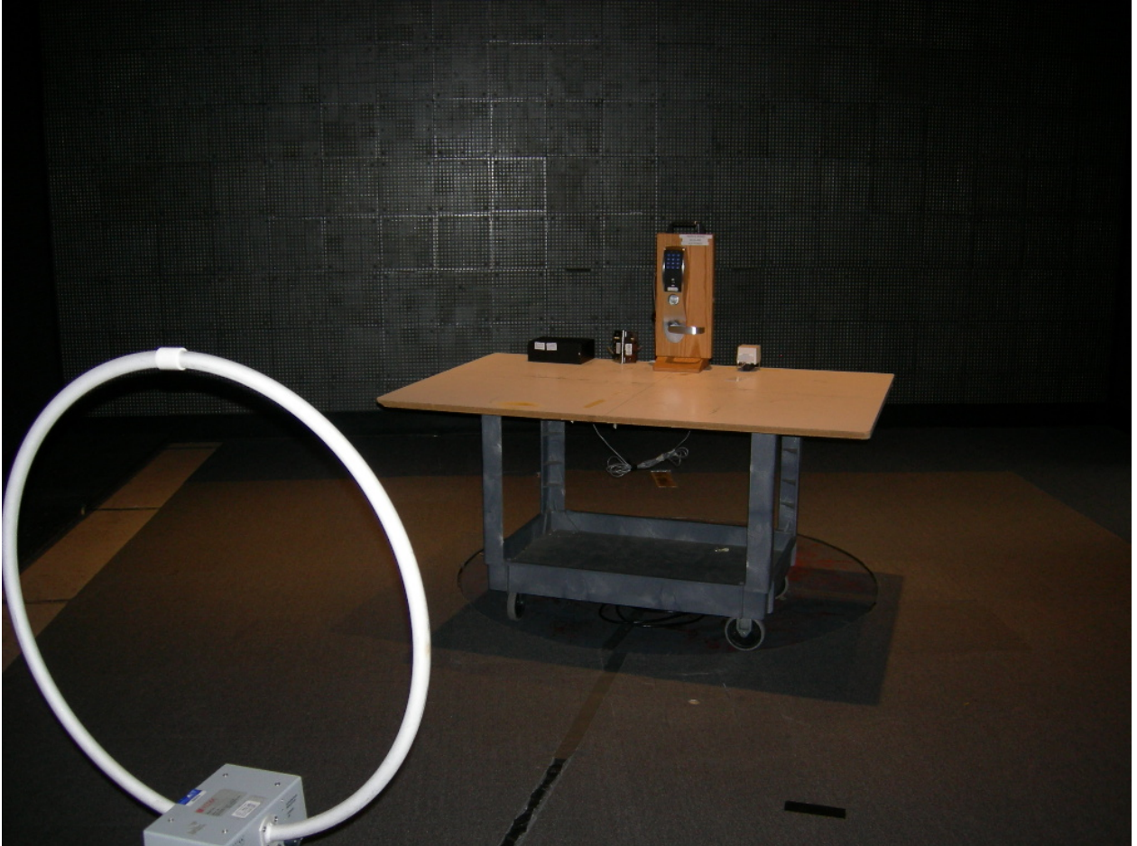
Figure 8: S2 Series – Radiated emissions