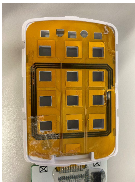
RFID Antenna Behind Touchscreen