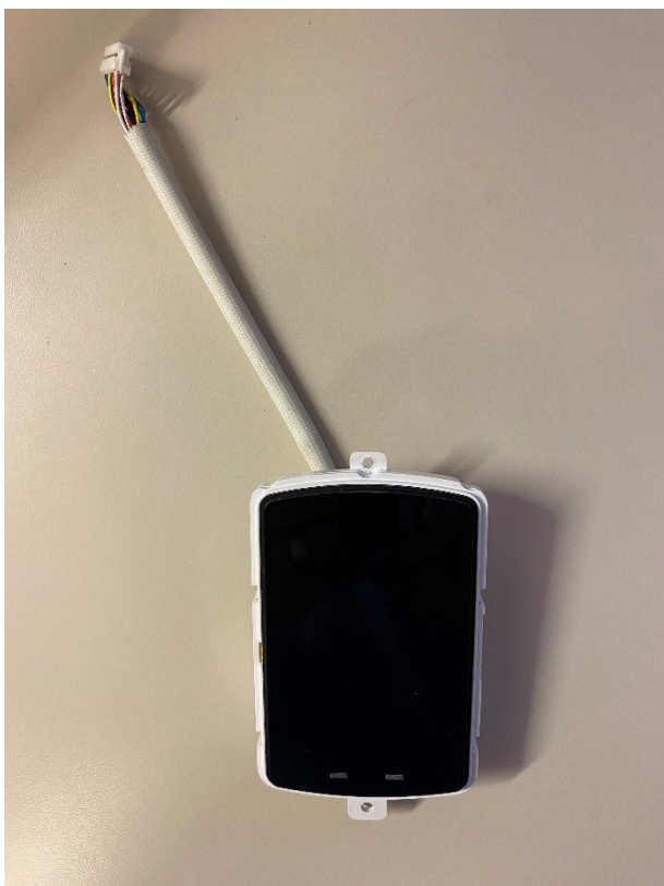
Touchscreen Assembly Front