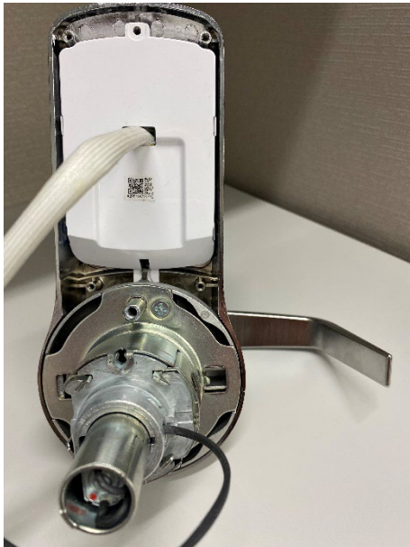
Back with backplate removed