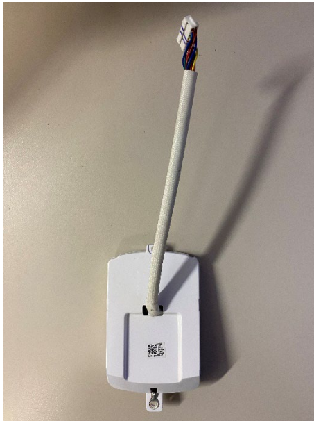
Touchscreen Assembly Back