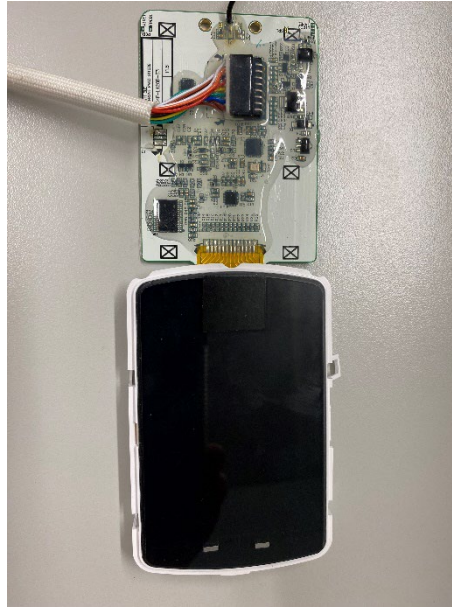
Touchscreen Front, PCB Back