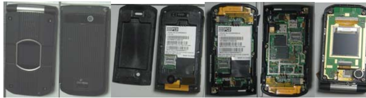
Figure 1_FCC ID: U46-CDM2080, Model: CDM2080US

The subject cell phone are compact handheld models as shown in figure 1, authorized under 47CFR Part 22H&24E&27L for CDMA mobile services.