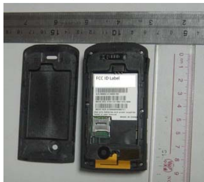
Figure 2_FCC ID: U46-CDM2080, Model: CDM2080US

Because the majority of the cell phone housing is composed of display, speaker, operating controls and a removable battery pack, there is extremely limited space available to attach the required label carrying the FCC identifier. Attaching the label to the battery pack is not acceptable because the battery pack is a removable item. For this reason, TeleEpoch Limited proposes placing the label carrying the FCC identifier inside the battery compartment as shown in figure 2.