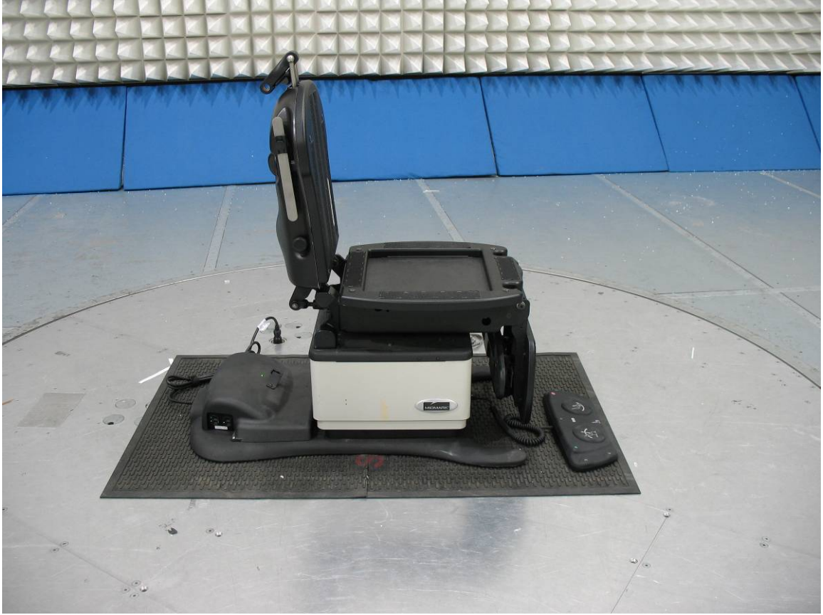
Radiated Emissions (Right Side)