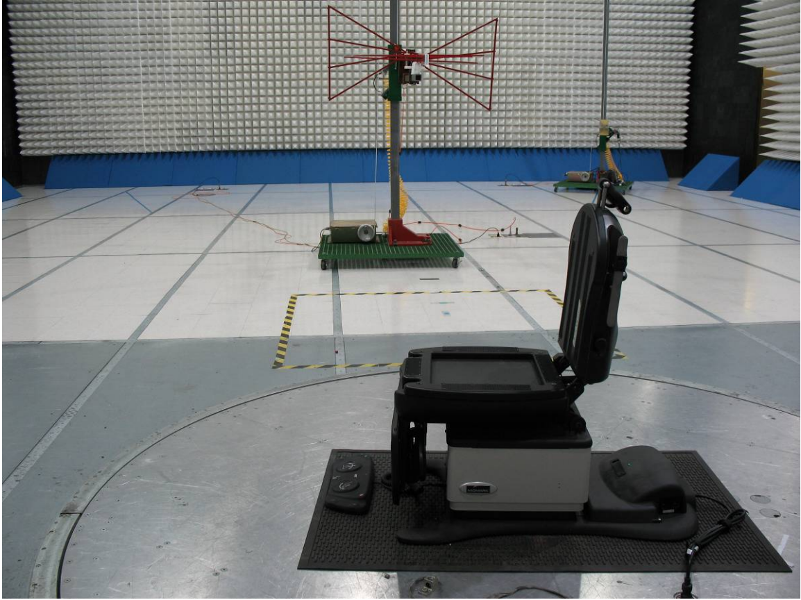
Radiated Emissions (Left Side)