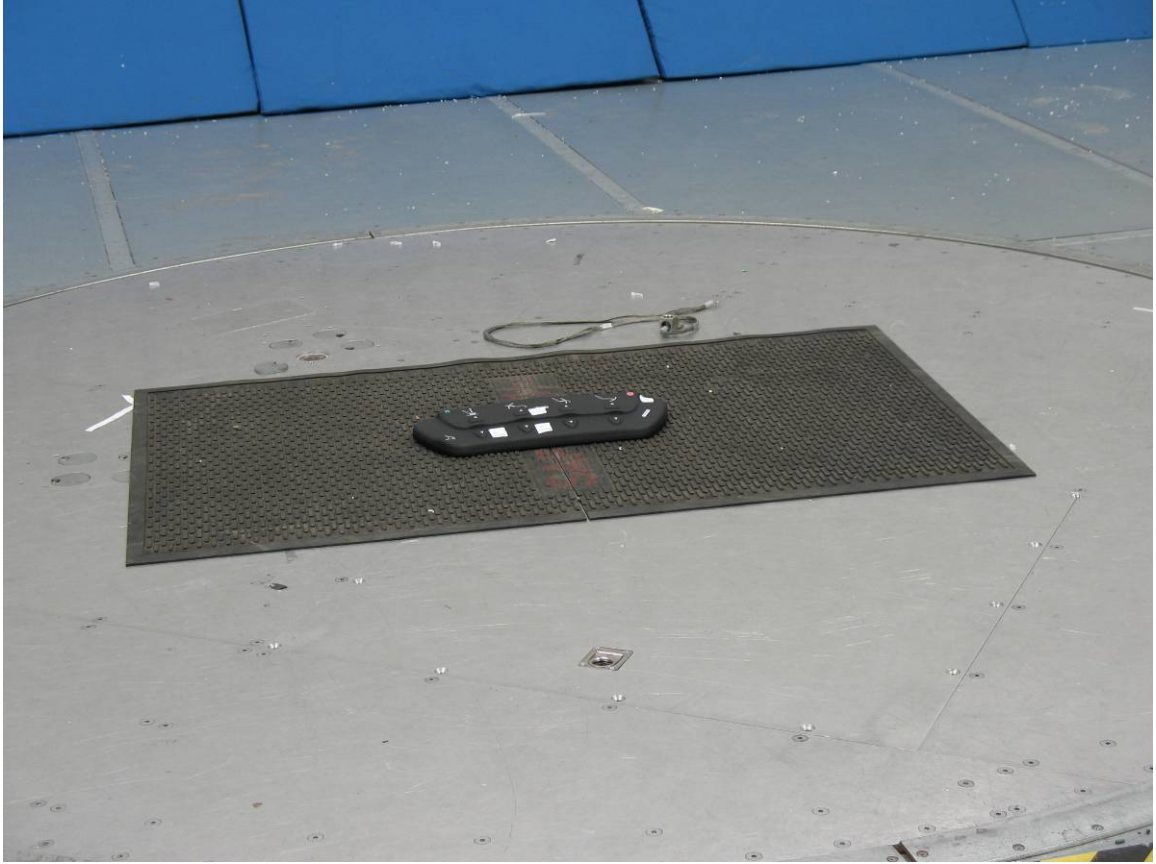
Radiated Emissions (Front)