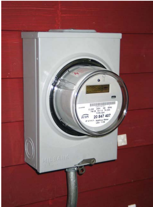
Figure 1 – Meter Installed into a Meter Socket