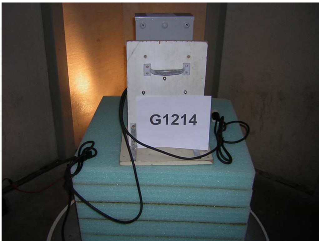
Radiated Emissions Rear