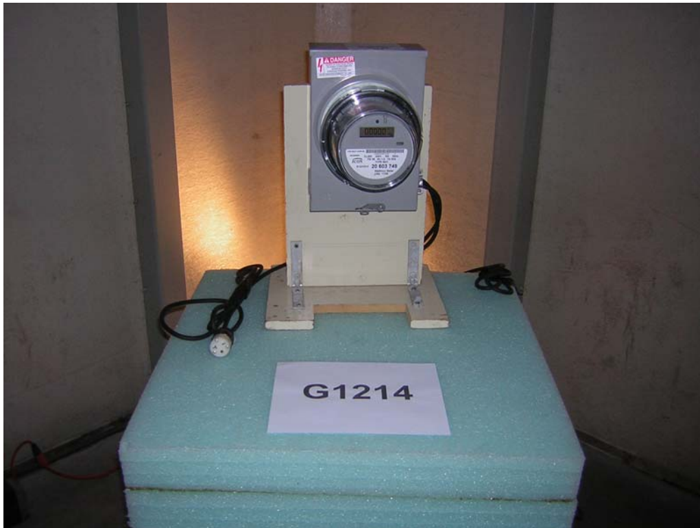
Radiated Emissions front