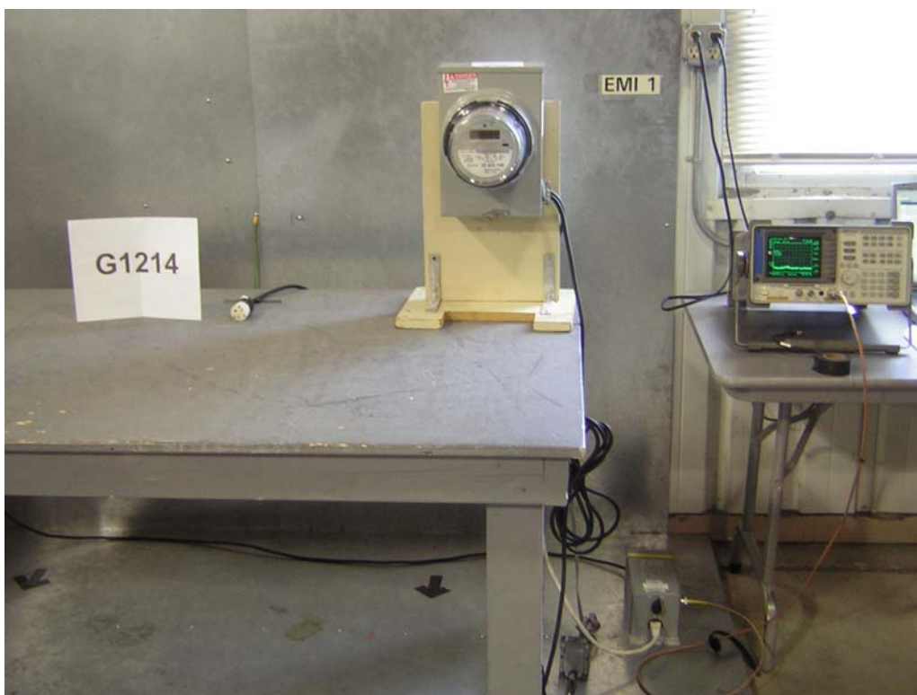
AC Line Conducted Emissions