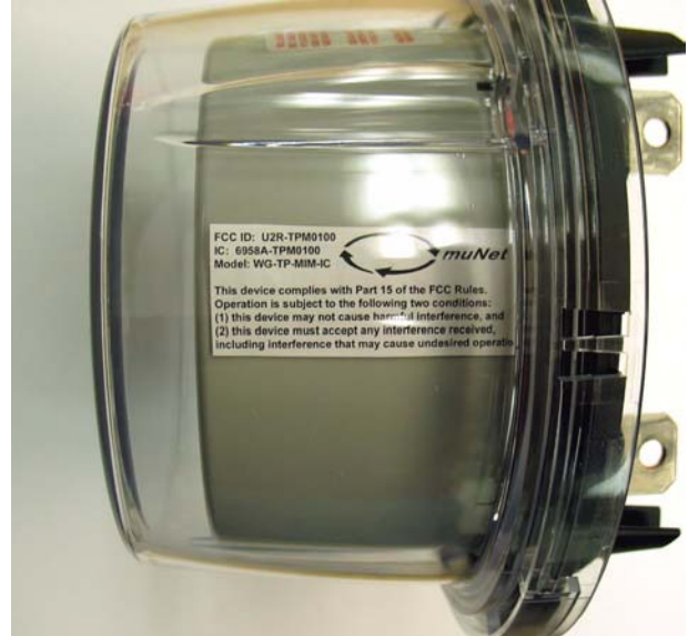
Figure 3 - Proposed Label Location