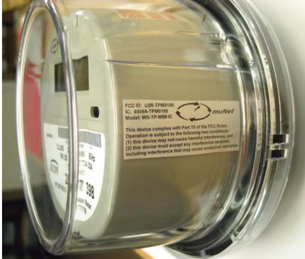
Figure 2 - Proposed Label Location