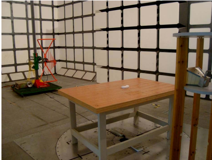
Radiated Emissions - Side View (30 MHz-1000MHz)