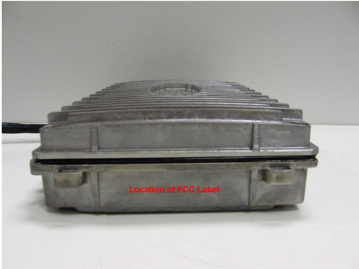
Figure 1 Location of FCC Label

Each label shall be applied to the unit at the location indicated in Figures 1 and 2 below. The label should be applied so that all vertical and/or horizontal markings can be read in the same direction as other labels on the unit.