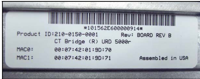
Figure 4 Sample Product Label

Depending on what product you are building the information for the Product ID, description serial number, revision level, and MAC Addresses will change.