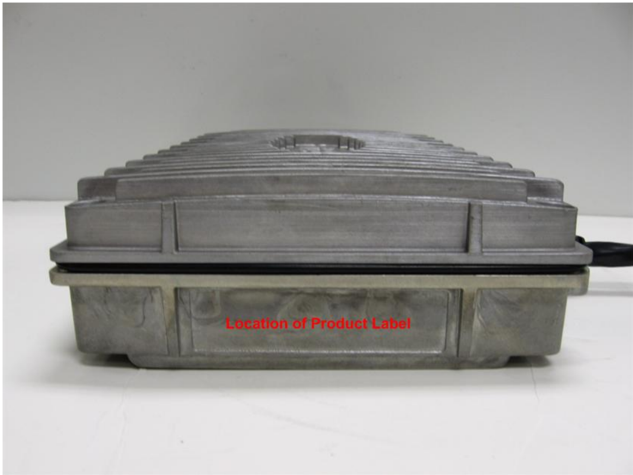
Figure 2 Location of Product Label