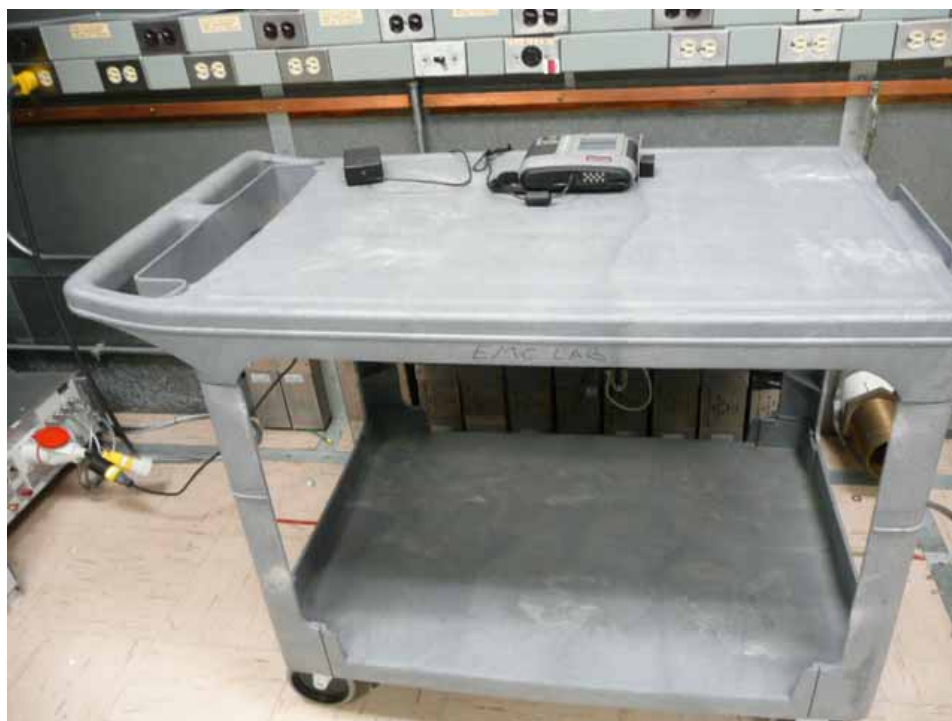
Frequency Stability (Voltage Variation ) Measurement