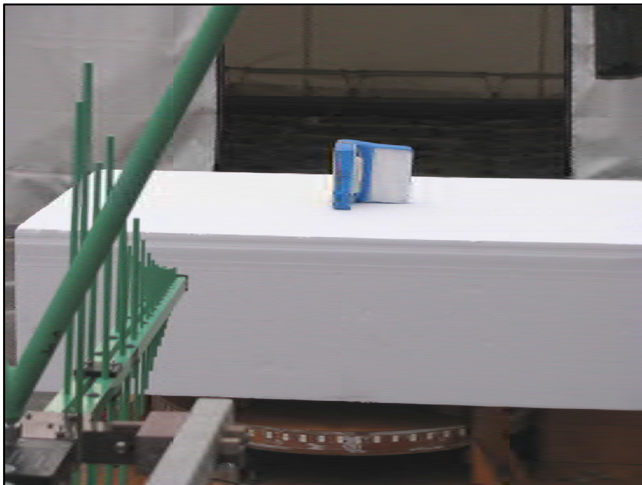
Photograph 3: Radiated Emissions Z-Axis