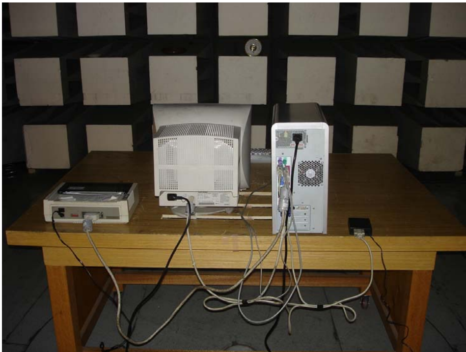
< Radiated emission – Rear >