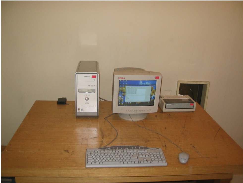
<Conducted emission – Front >