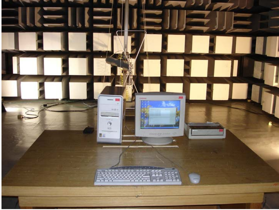
< Radiated emission – Front >